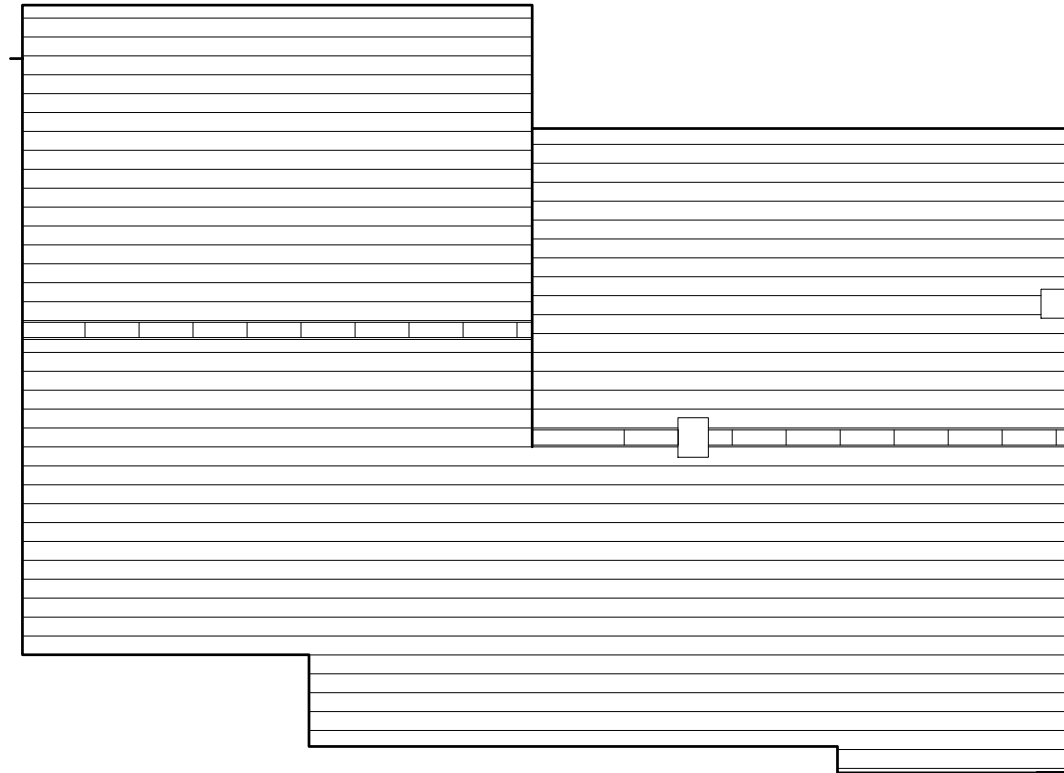
EXISTING ROOF PLAN SCALE - 1:100 @ A3