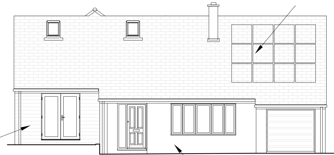
EXISTING SOUTH ELEVATION SCALE - 1:100 @ A3

Walls finished in horizontal Timber Cladding