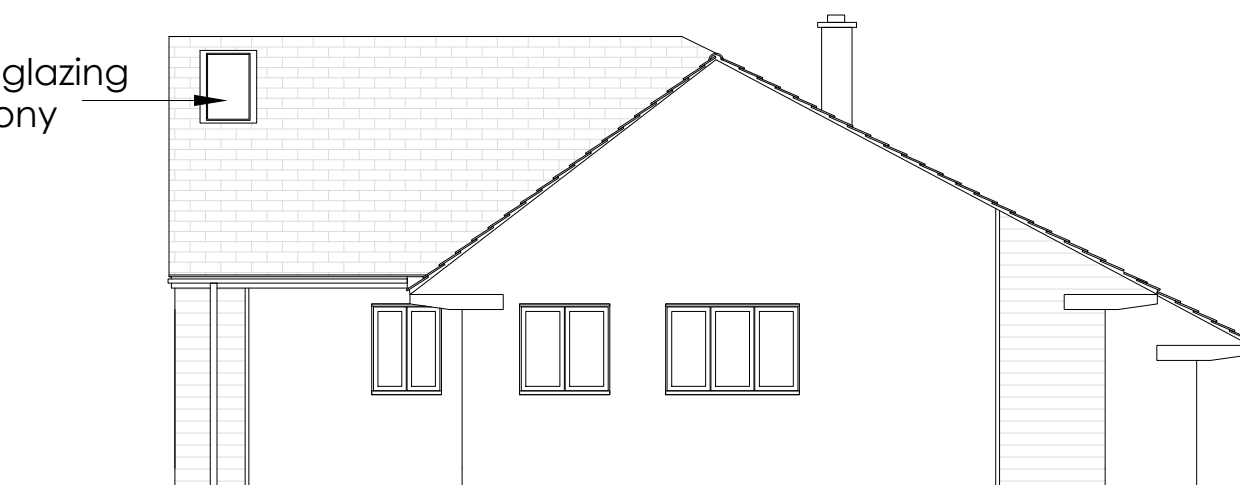
EXISTING WEST ELEVATION SCALE - 1:100 @ A3

All windows to be anthracite grey UPVC, with Bilfod doors in aluminium. All Rainwater goods, fascias and soffits to be matching anthracite grey.