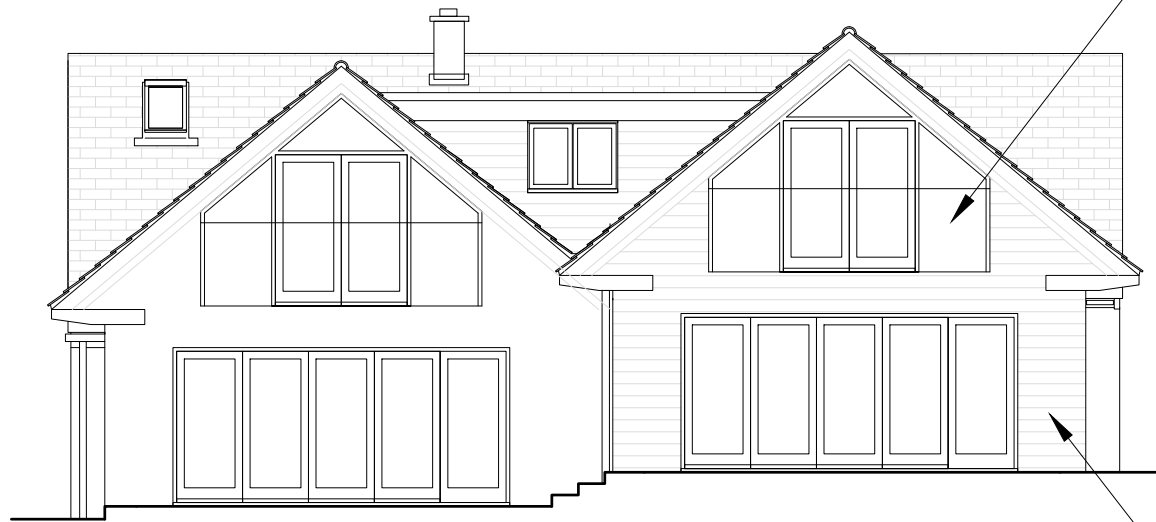
EXISTING NORTH ELEVATION SCALE - 1:100 @ A3

Walls finished in horizontal Timber Cladding