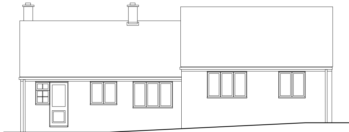
EXISTING NORTH ELEVATION SCALE - 1:100 @ A3