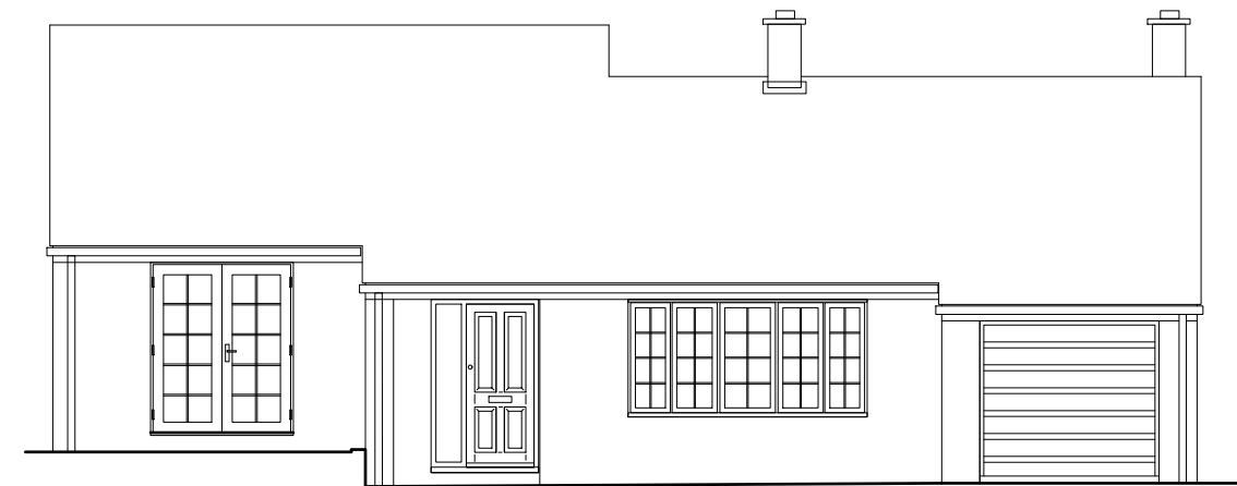
EXISTING SOUTH ELEVATION SCALE - 1:100 @ A3