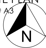
EXISTING SITE PLAN SCALE - 1:200 @ A3

Ordnance Survey (c) Crown Copyright 2022. All rights reserved. Licence number 100022432