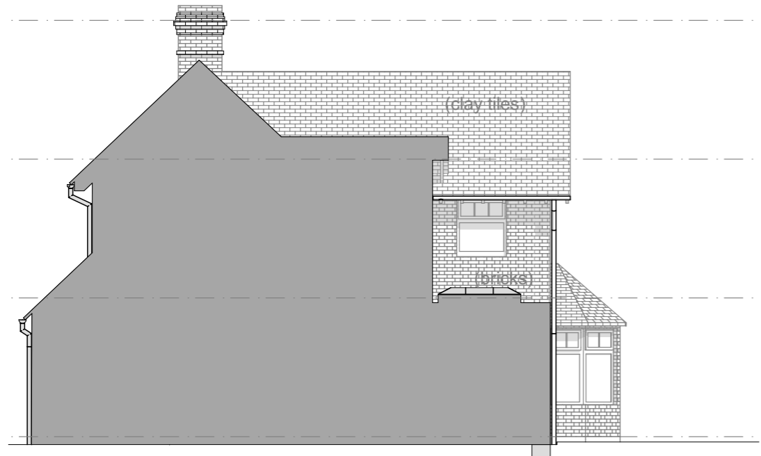
South West Elevation - Proposed 1:100