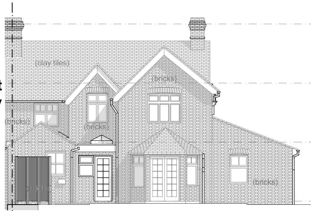
South East Elevation - Proposed 1:100