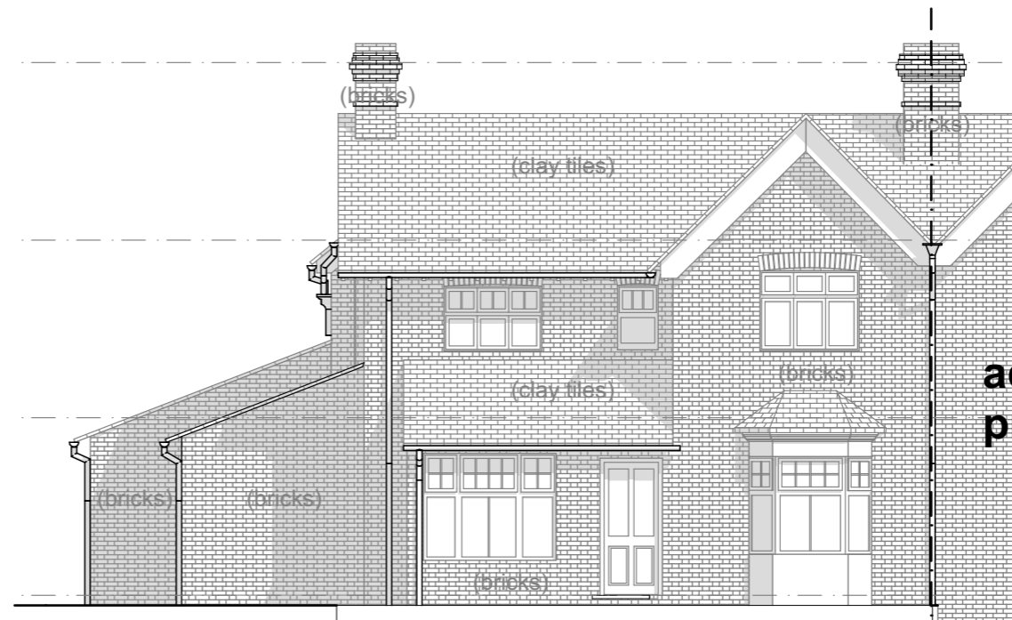
North East Elevation - Proposed 1:100