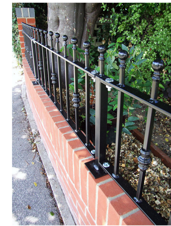
Brick wall and railings example