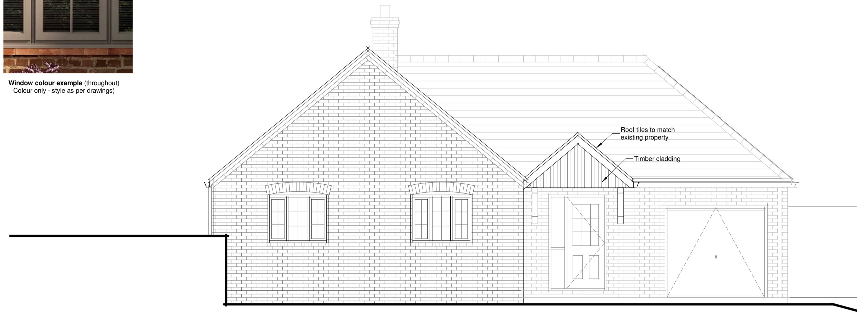
Front Elevation (East) 1 : 50