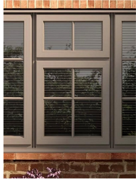
Window colour example (throughout) Colour only - style as per drawings