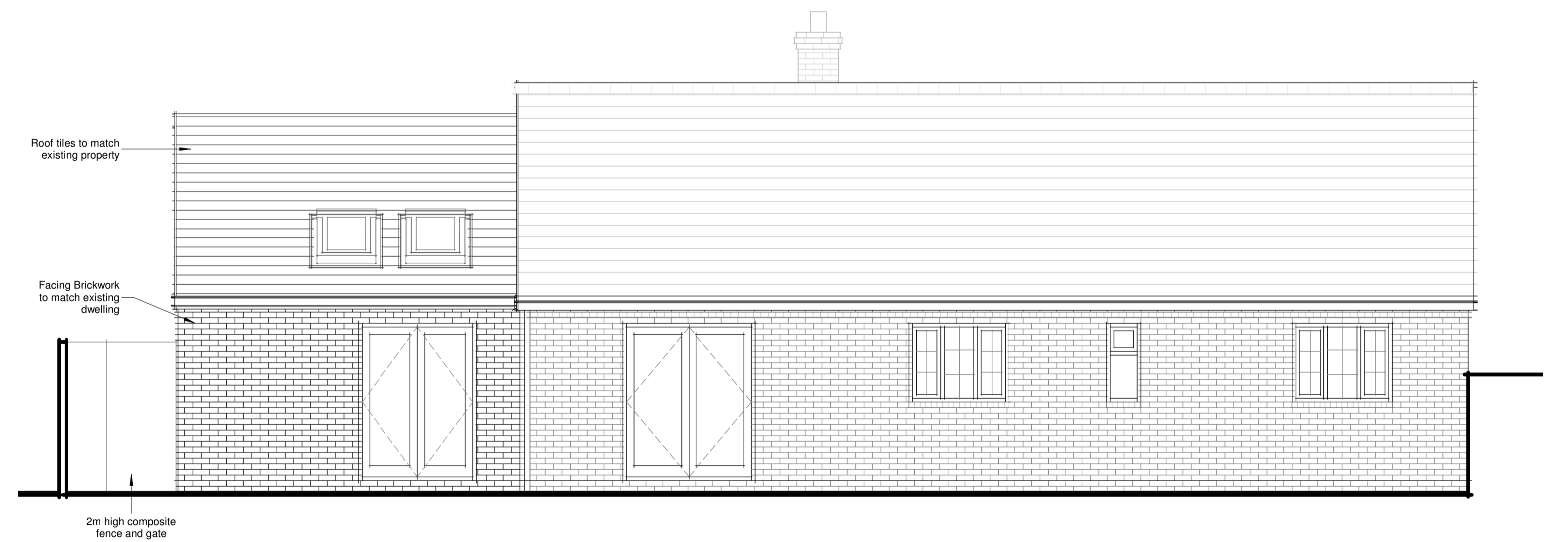
Side Elevation (South) 1 : 50