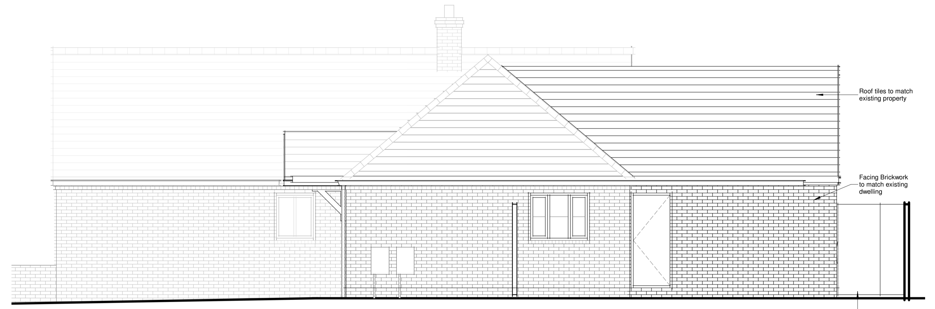
Side Elevation (North) 1 : 50