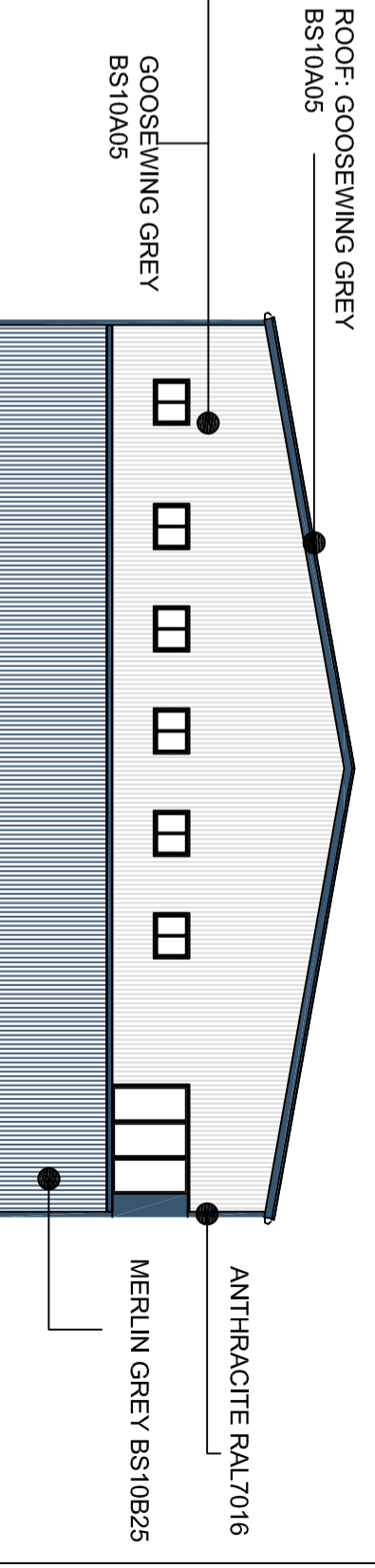
NORTH ELEVATION SCALE 1:200