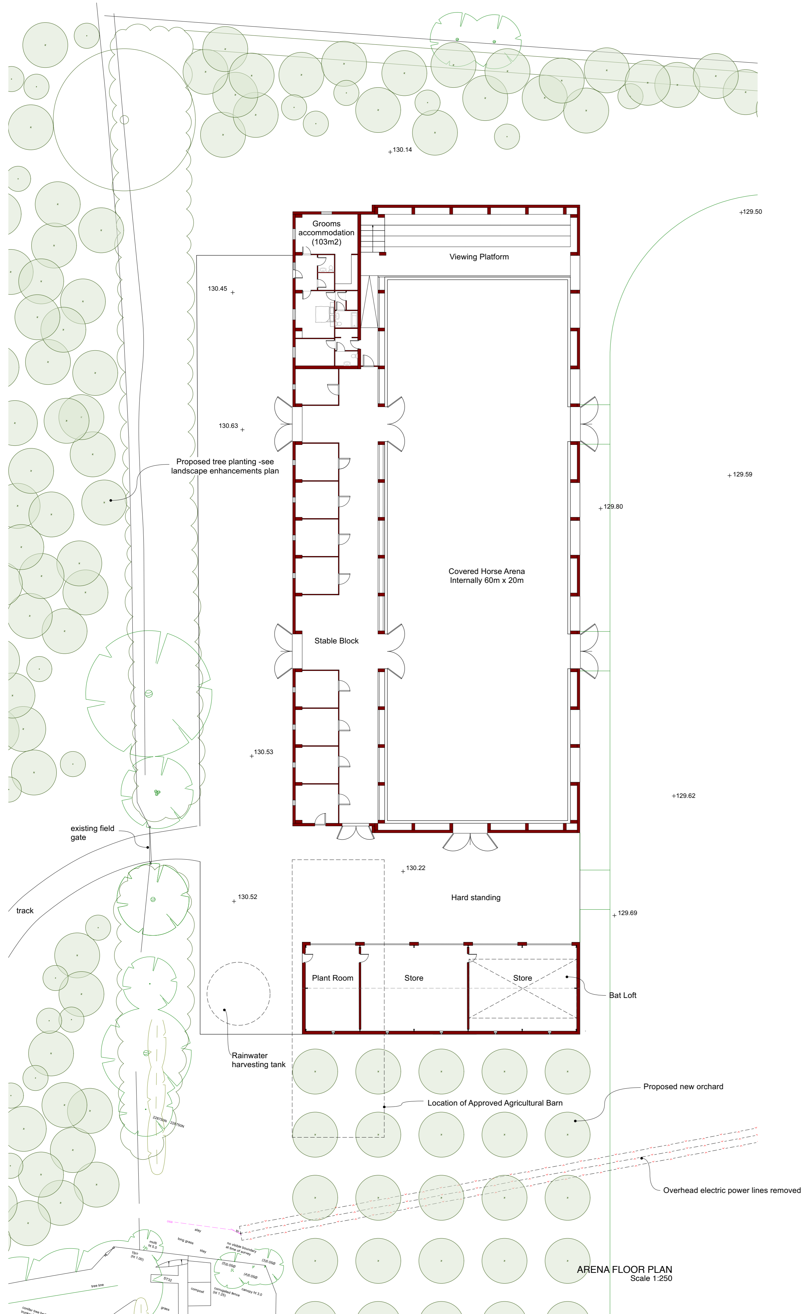
ARENA FLOOR PLAN Scale 1:250