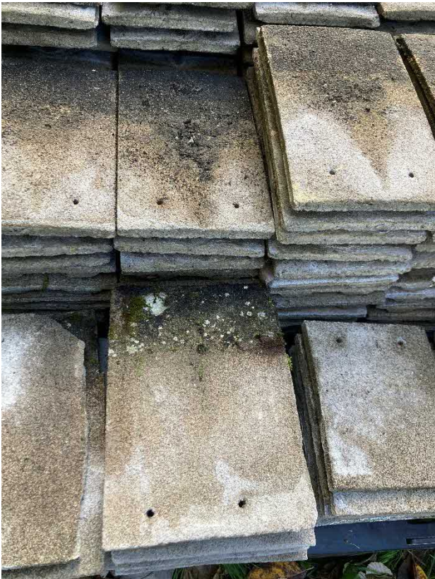
Existing roof tiles