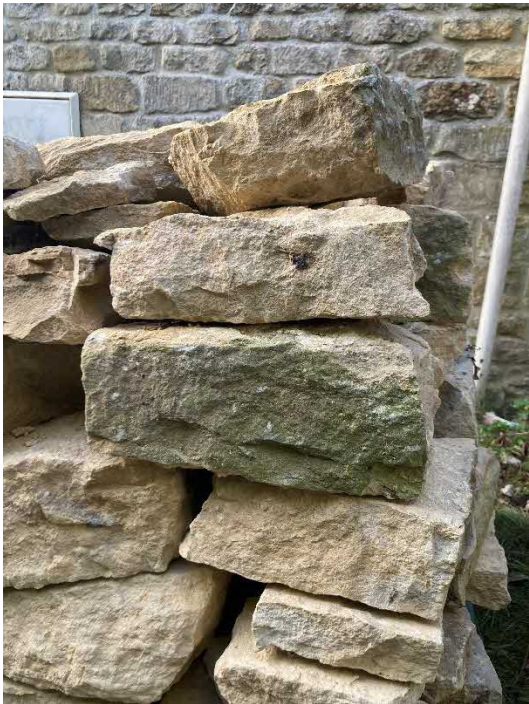
Photo above shows new and existing stone mixed on pallet