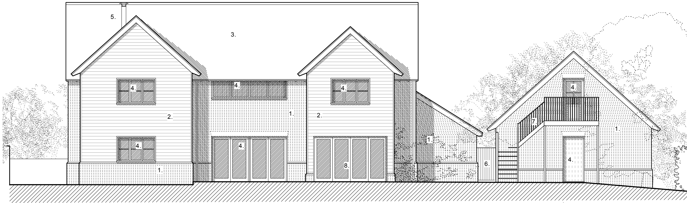
Land at Norton End, Wendens Ambo / Rear Elevation (3)