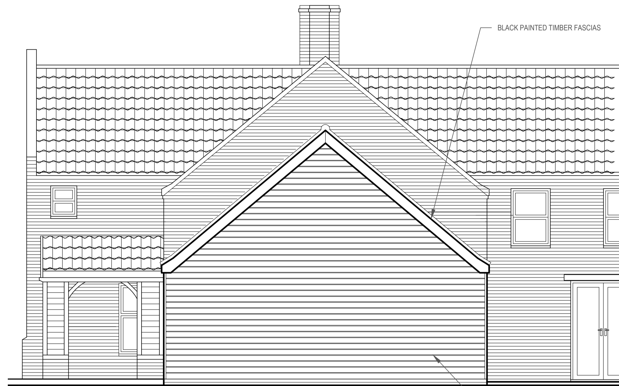
PROPOSED (PART) SIDE ELEVATION SCALE 1:50 AT A1