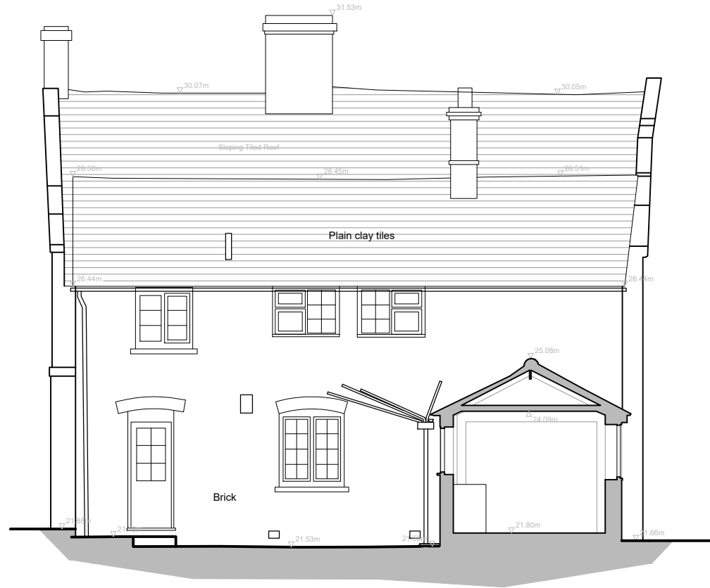
North West Elevation Scale 1:100 @ A3