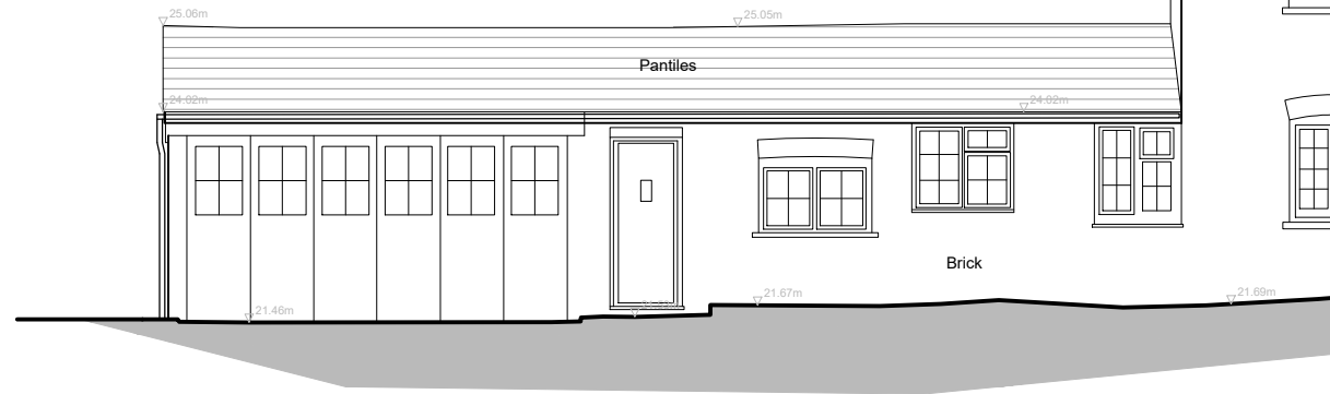
South West Elevation (Front) Scale 1:100 @ A3

NOTES: Do Not Scale. Report all discrepancies, errors and omissions. Verify all dimensions on site before commencing any work on site or preparing shop drawings. All materials, components and workmanship are to comply with the relevant British Standards, Codes of Practice, and appropriate manufacturers recommendations that from time to time shall apply. For all specialist work, see relevant drawings. This drawing and design are copyright of Clague LLP Registration number OC335948.