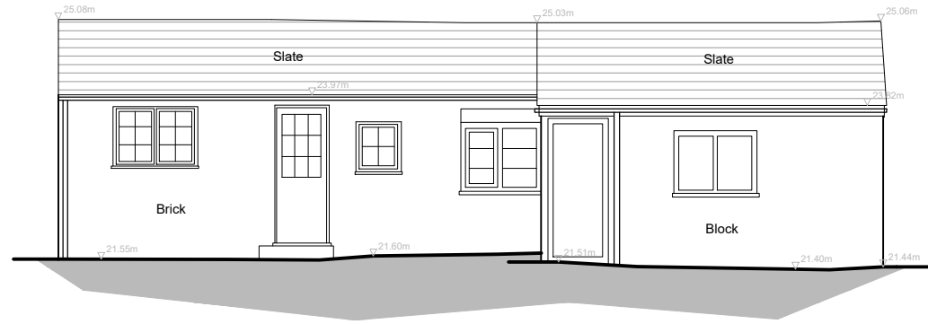
North East Elevation (Rear) Scale 1:100 @ A3