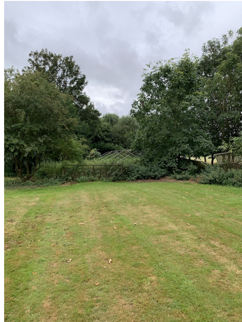
Plate 7: Looking south-east from within the plot showing the overgrown vegetable area and poly tunnel frame with a glimpse view through to the golf course in the background. The open board fencing along the site boundary has collapsed in this area.

Refer to Photograph key Drwg No 418.PS.01 for viewing locations.