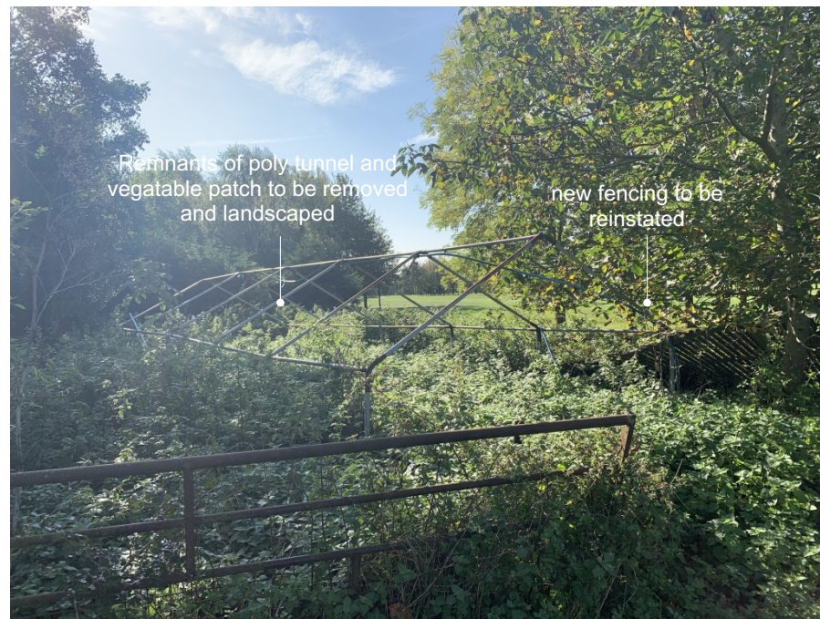
Plate 6: Looking south-east from within the plot showing the overgrown vegetable area and poly tunnel frame with a glimpse view through to the golf course in the background.