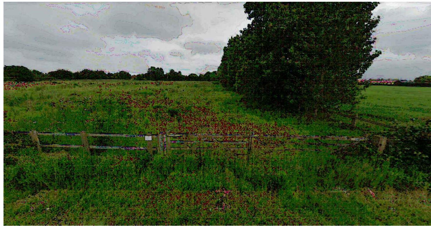
View 1 - Existing gated access at site.