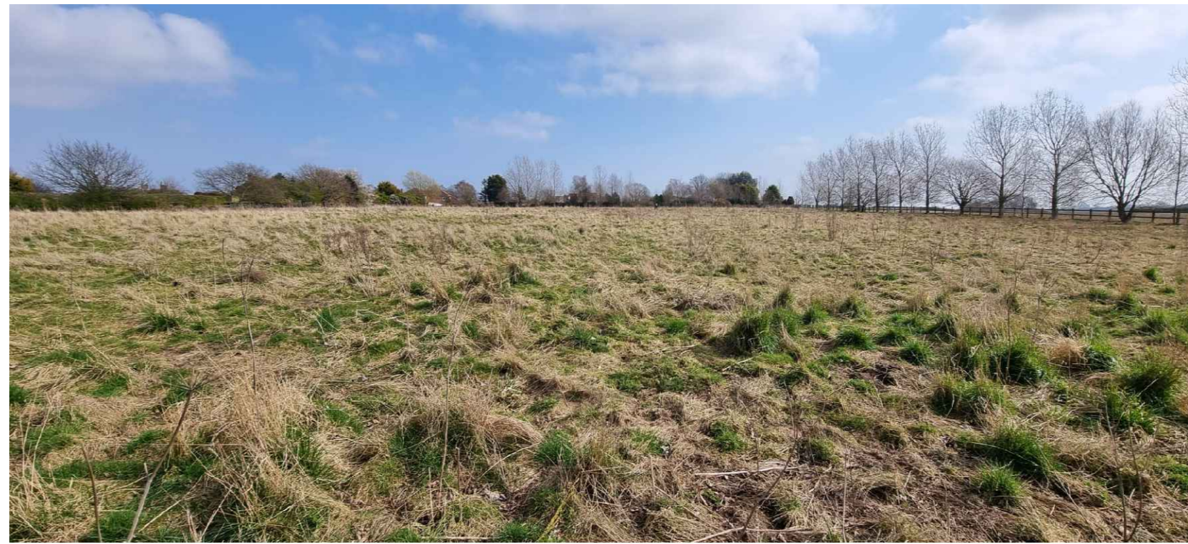
View 2 - View across the site facing East.