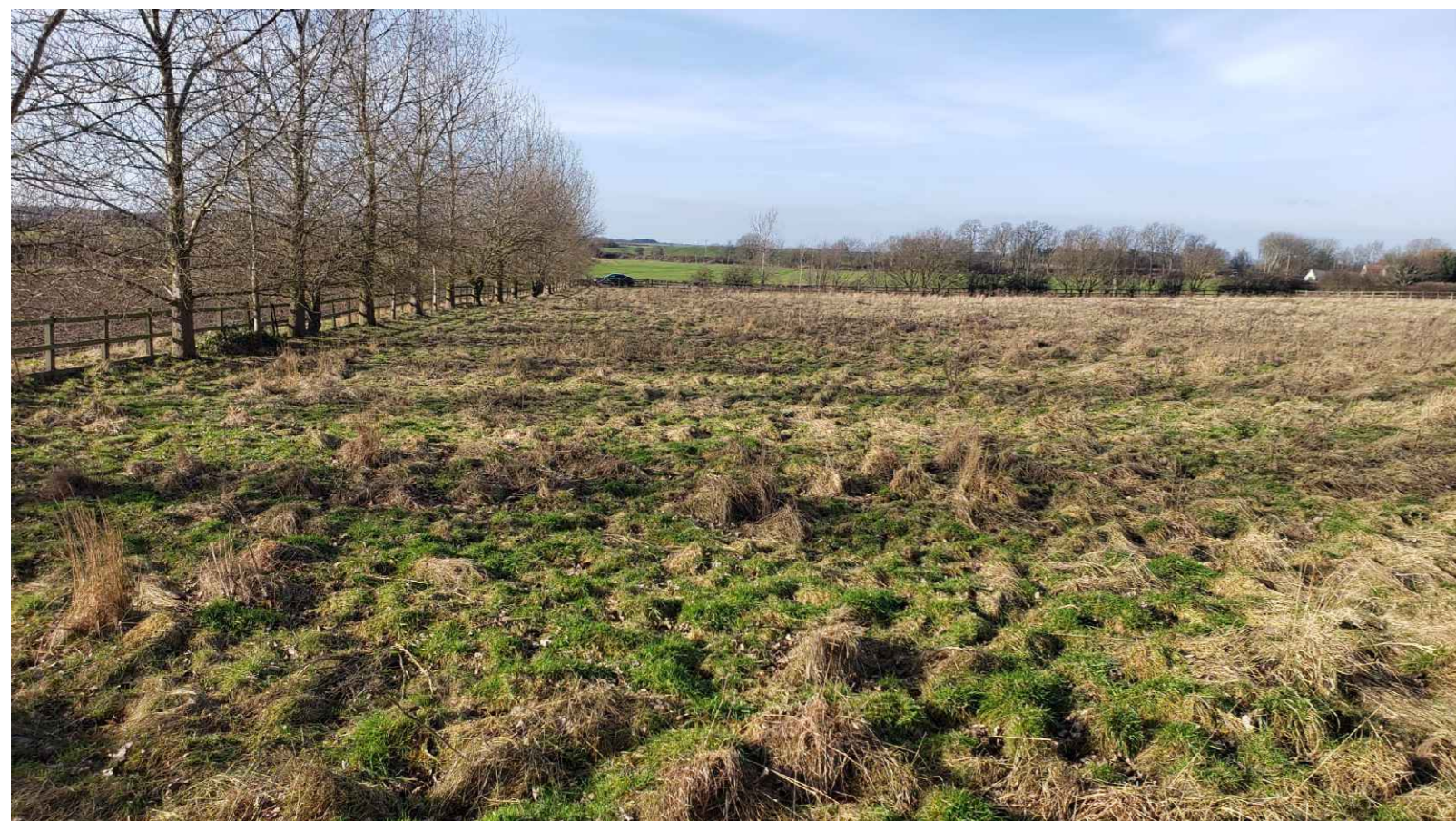
View 3 - View across site facing West.