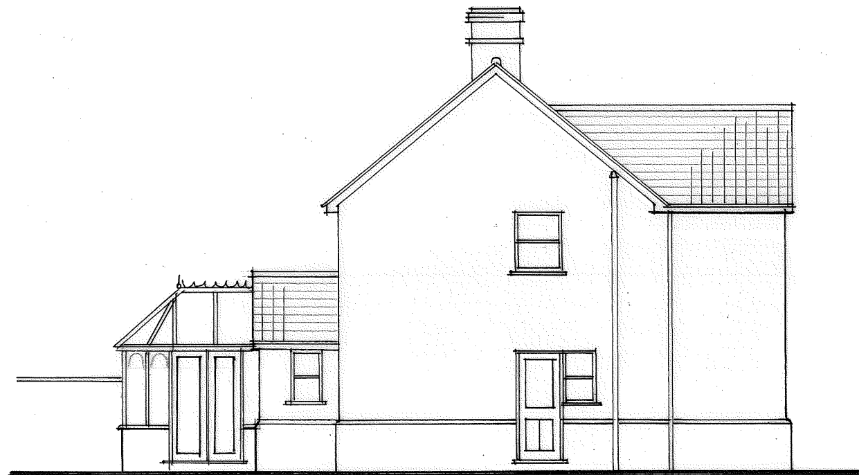
SIDE · NORTH · ELEVATION