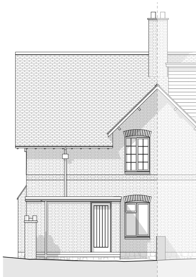
Existing Rear Courtyard (West) Elevation Scale 1:100 @A3