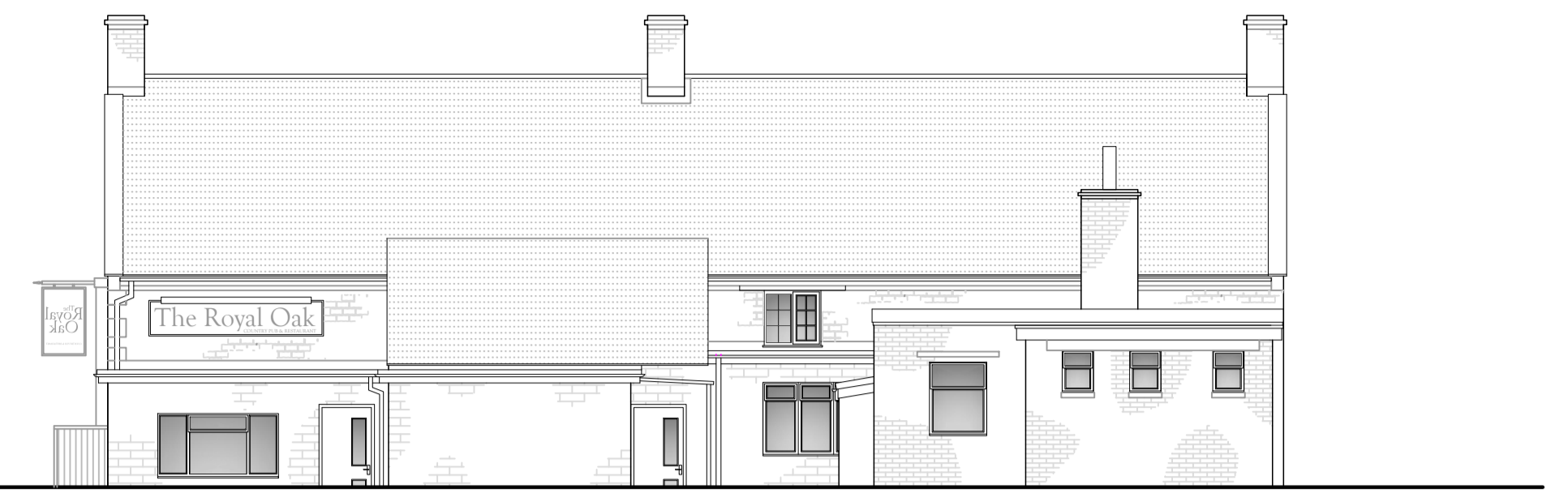
Rear at Car Park level