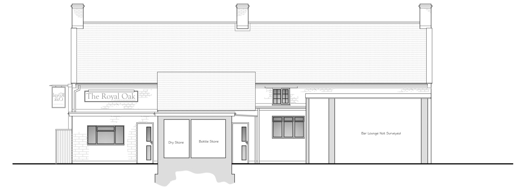
Rear at Kitchen level