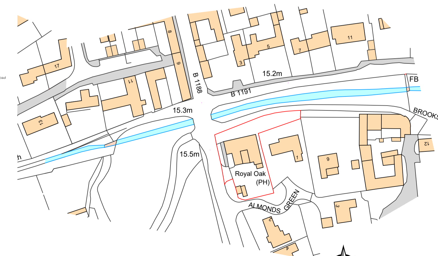
Site Location Plan (scale 1:1250)