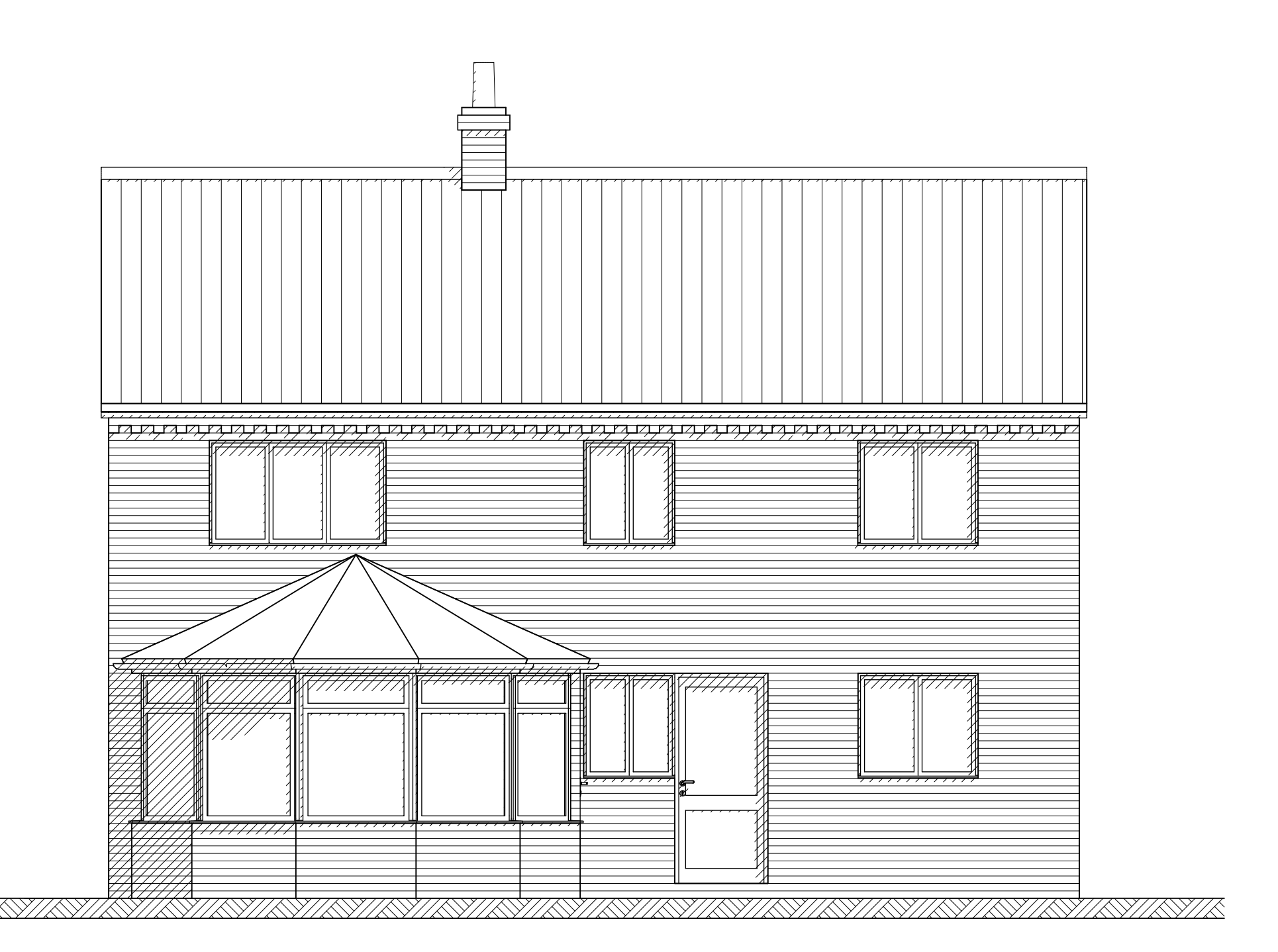
West elevation existing