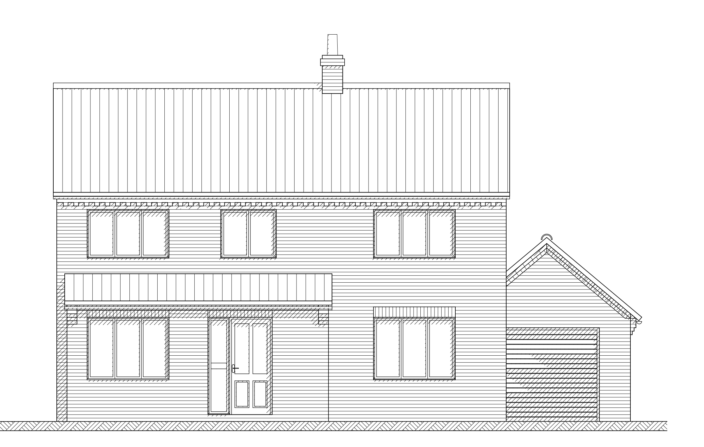
East elevation existing