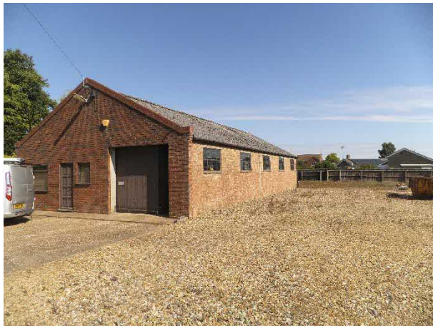
Building one with asbestos roof.