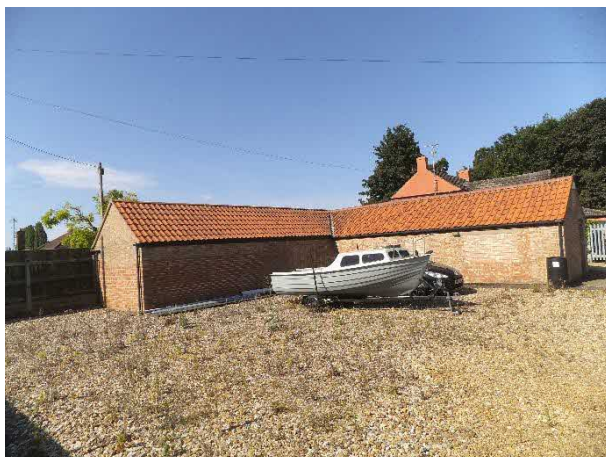
Building two with tiled roof