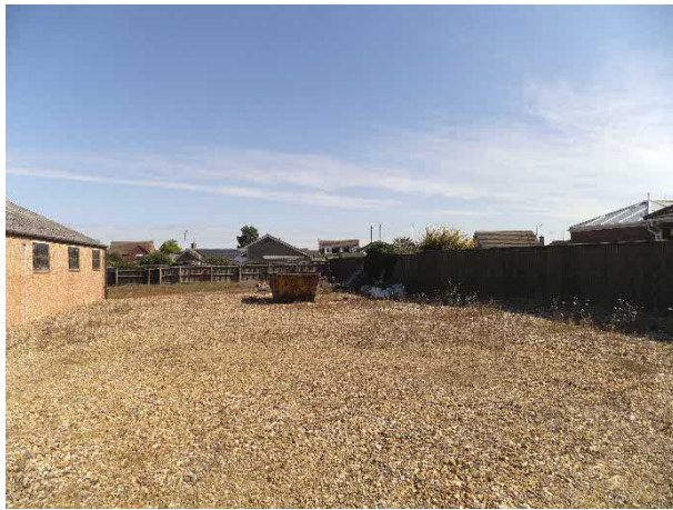
The site laid to hardcore

Two brick built structures on site used for storage of materials. One building is known to have an asbestos roof, the other is tiled.