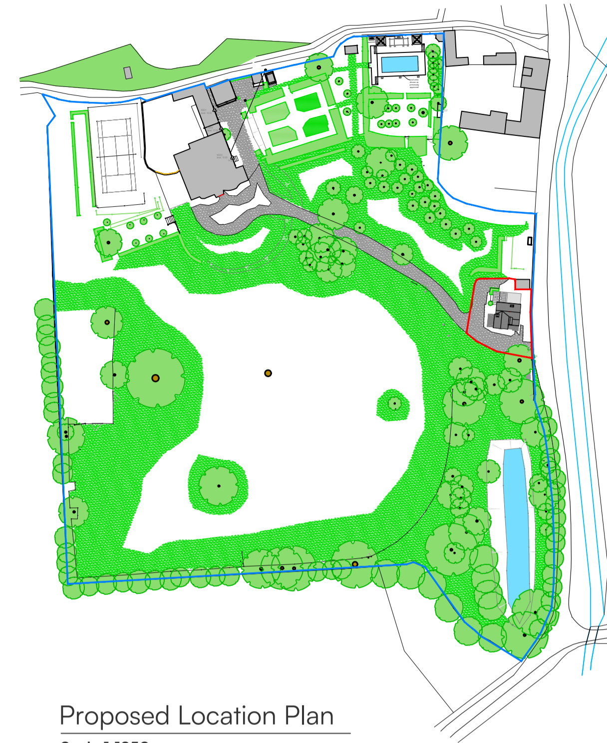
Proposed Location Plan Scale 1:1250