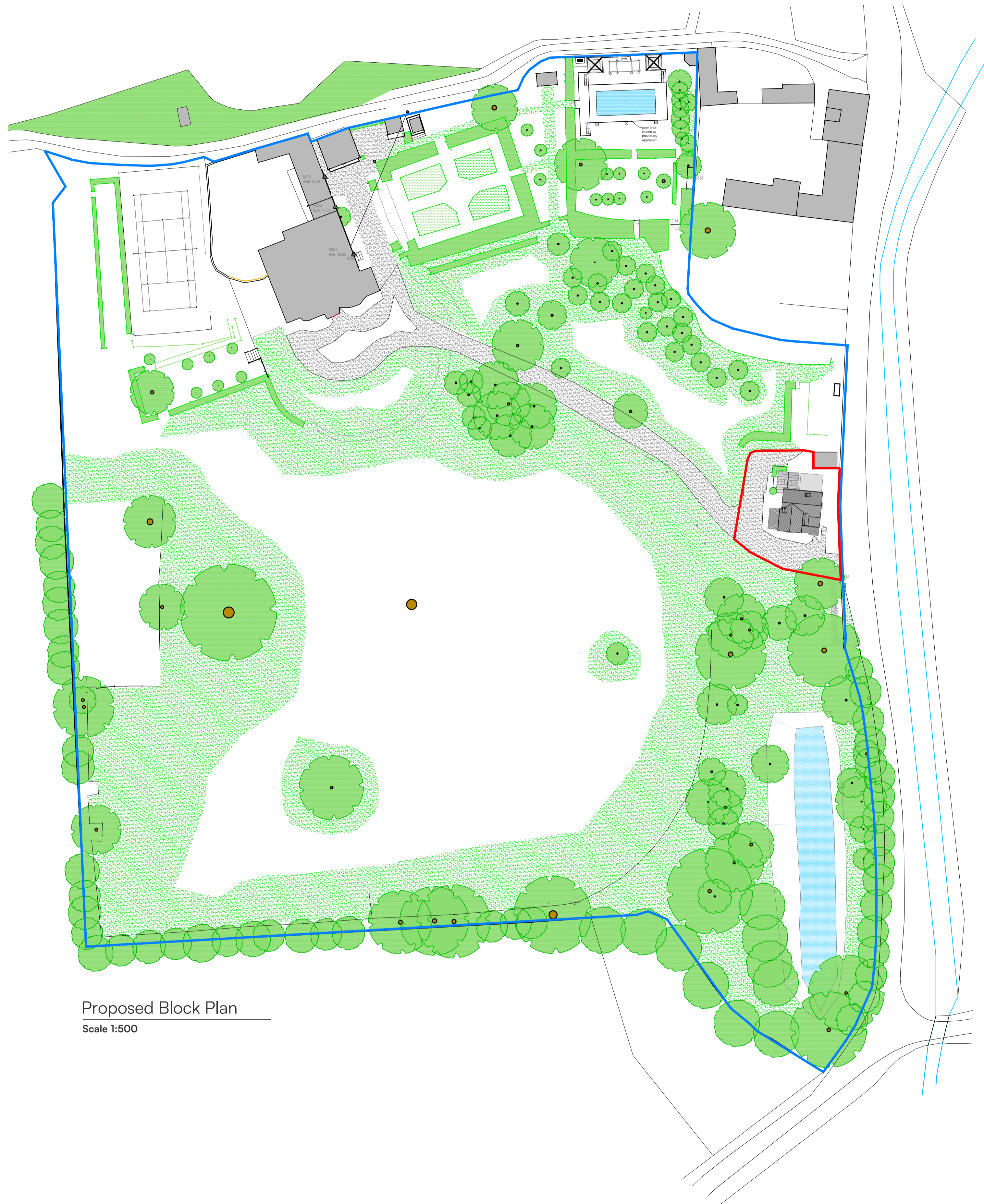
Proposed Block Plan Scale 1:500