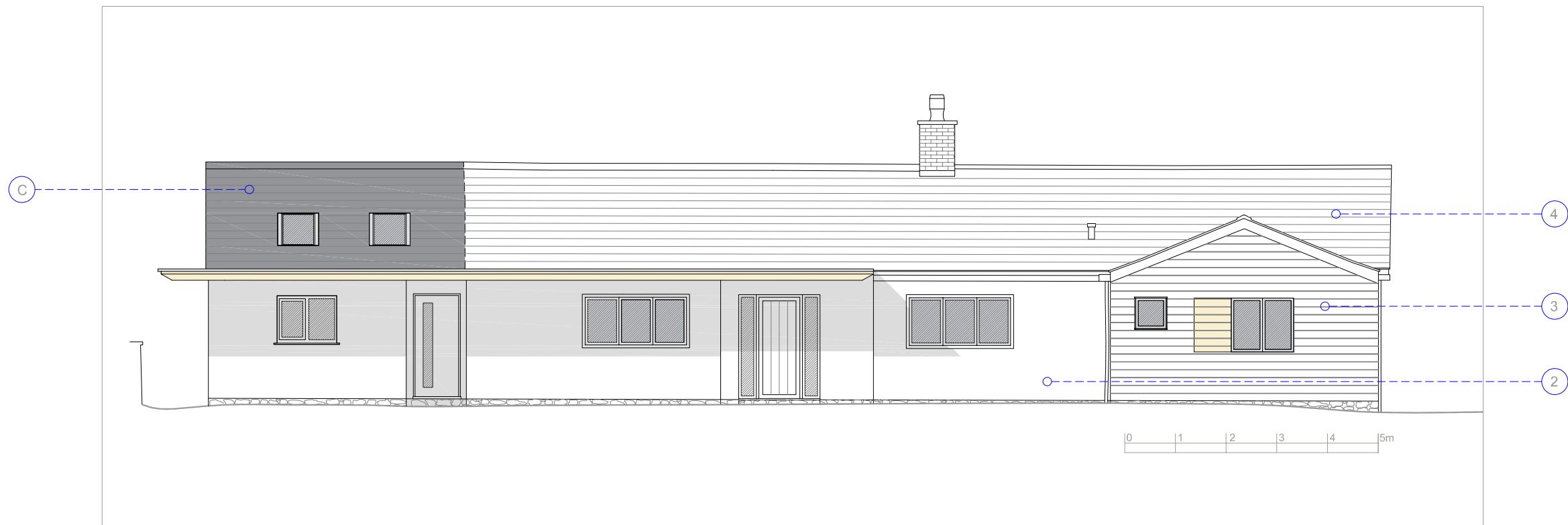
North East Elevation 1:100