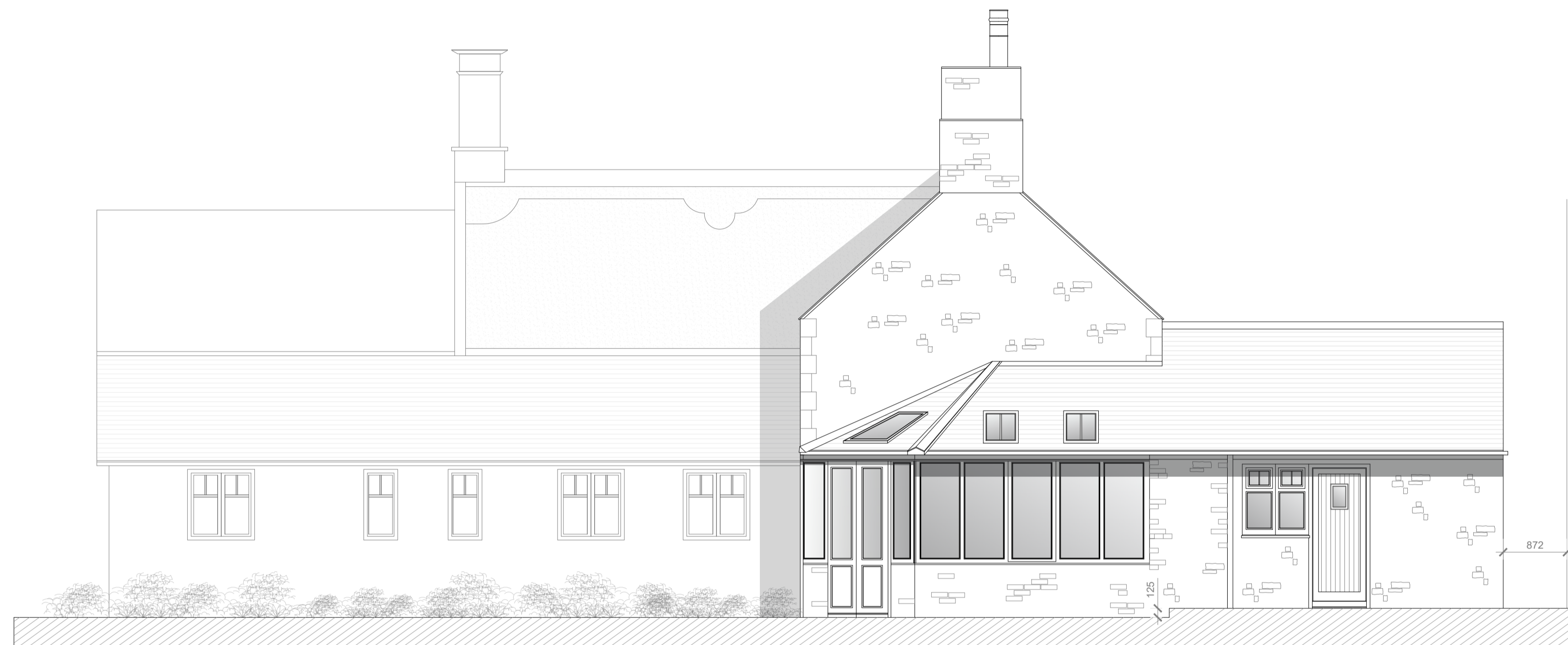
Existing North East Elevation Scale 1:50