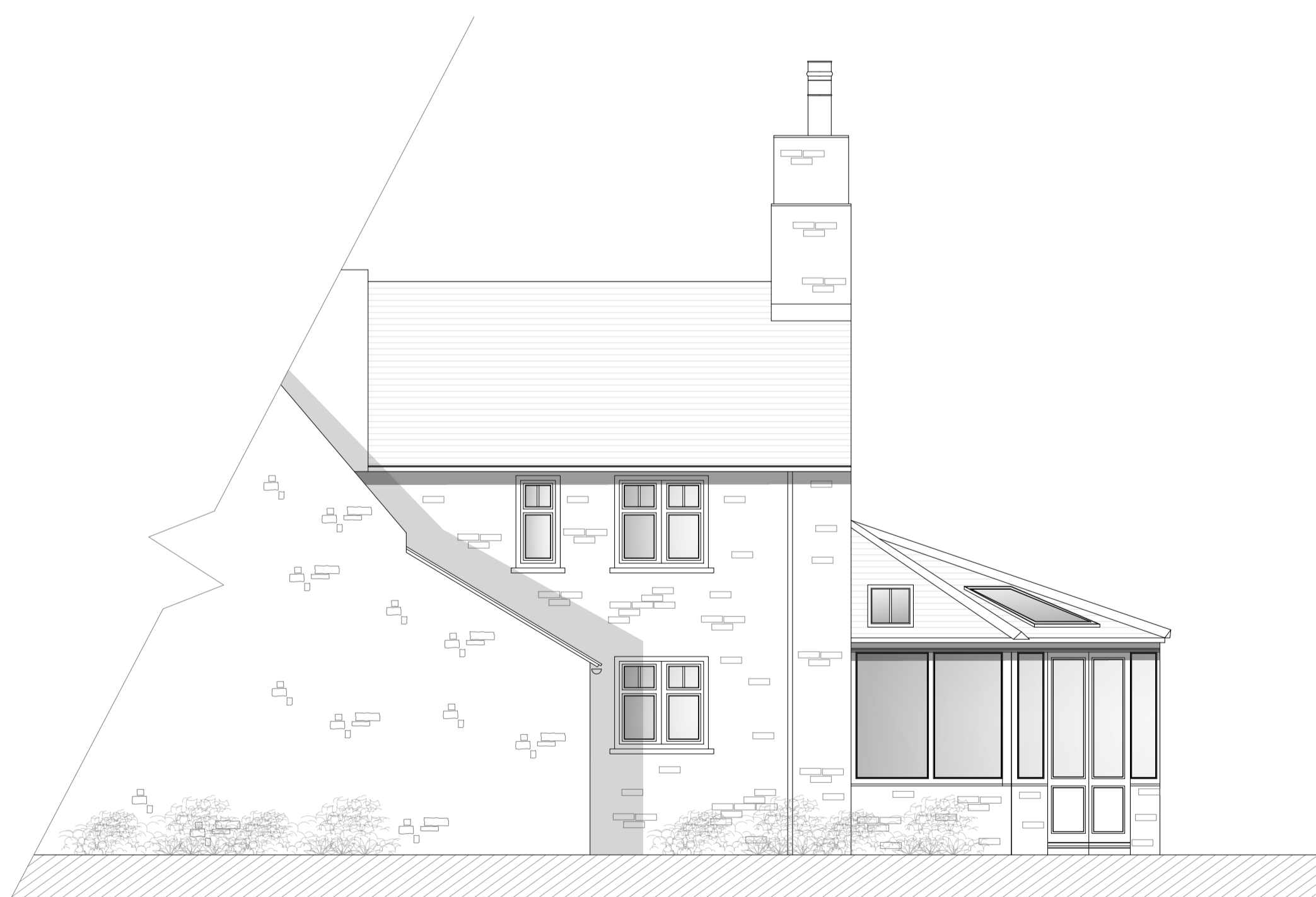
Existing South East Elevation Scale 1:50