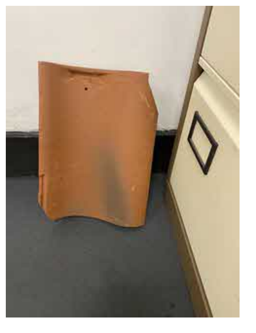
Proposed timber cladding will be 150mm feather edge.