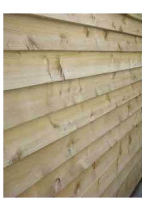
Proposed render is Silicone K Render in an off white