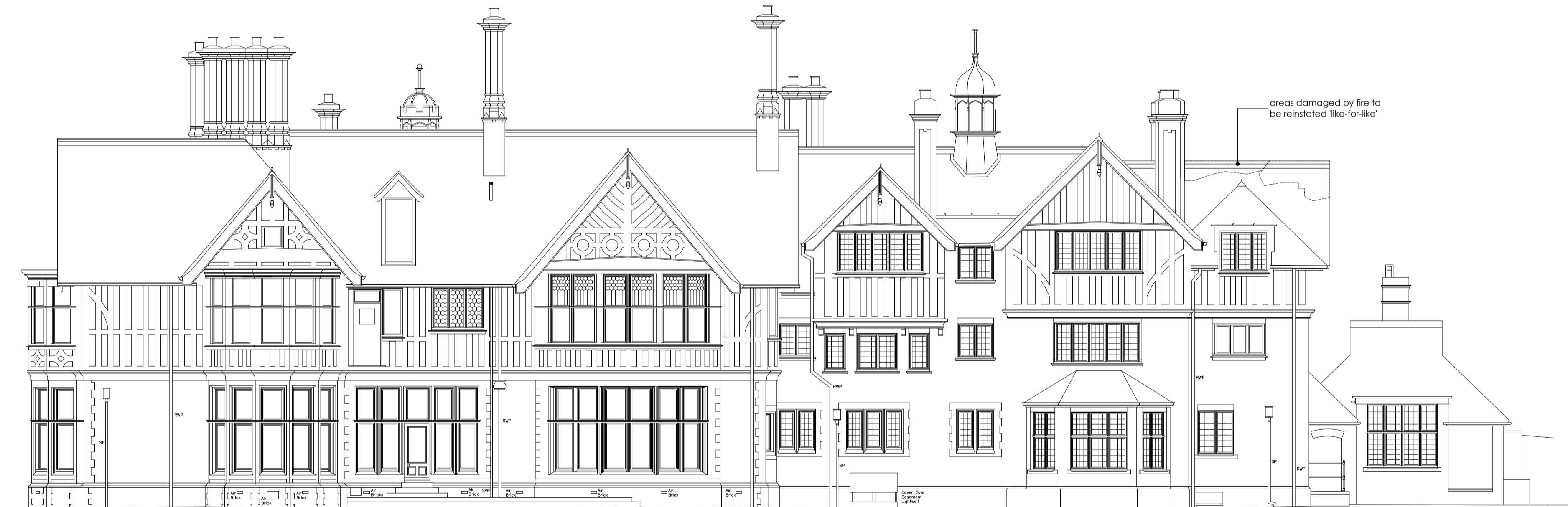
18m A.O.D. PROPOSED EAST ELEVATION scale 1:100