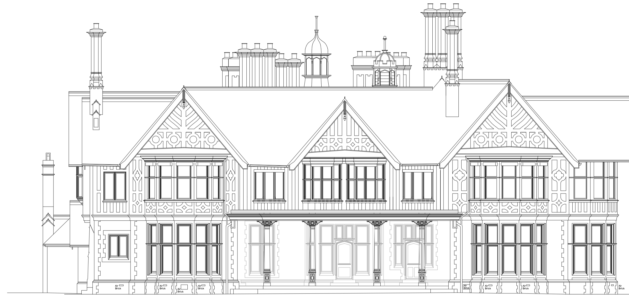
18m A.O.D. PROPOSED SOUTH ELEVATION scale 1:100