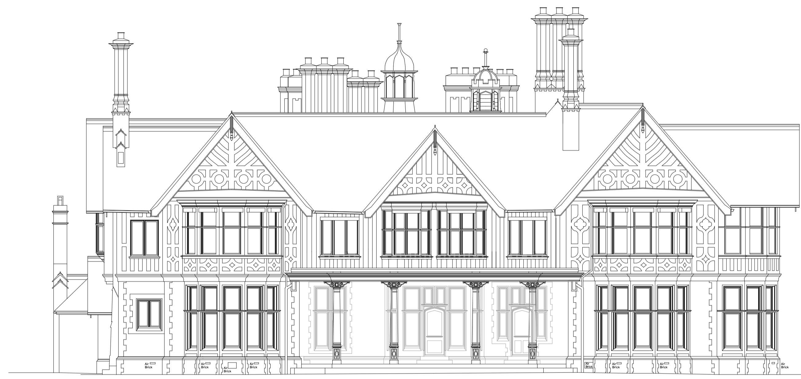
±18m A.O.D. EXISTING SOUTH ELEVATION scale 1:100

KEMP HOUSE, 160 CITY ROAD, LONDON, EC1V 2HX, UK T: +44 (0) 7525 336644 Anna T: +44 (0) 7707 929192 Katarzyna E: info@shapeofarchitecture.com