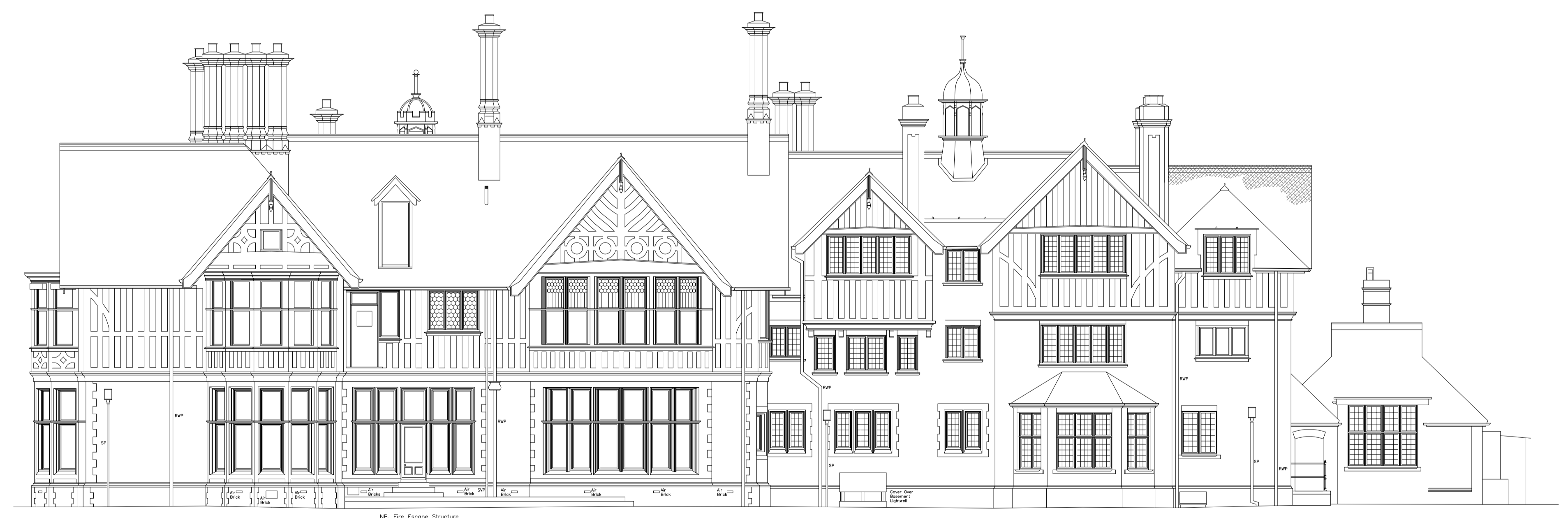
±18m A.O.D. EXISTING EAST ELEVATION scale 1:100

NS: Fire Escape Structure Omitted For Clarity