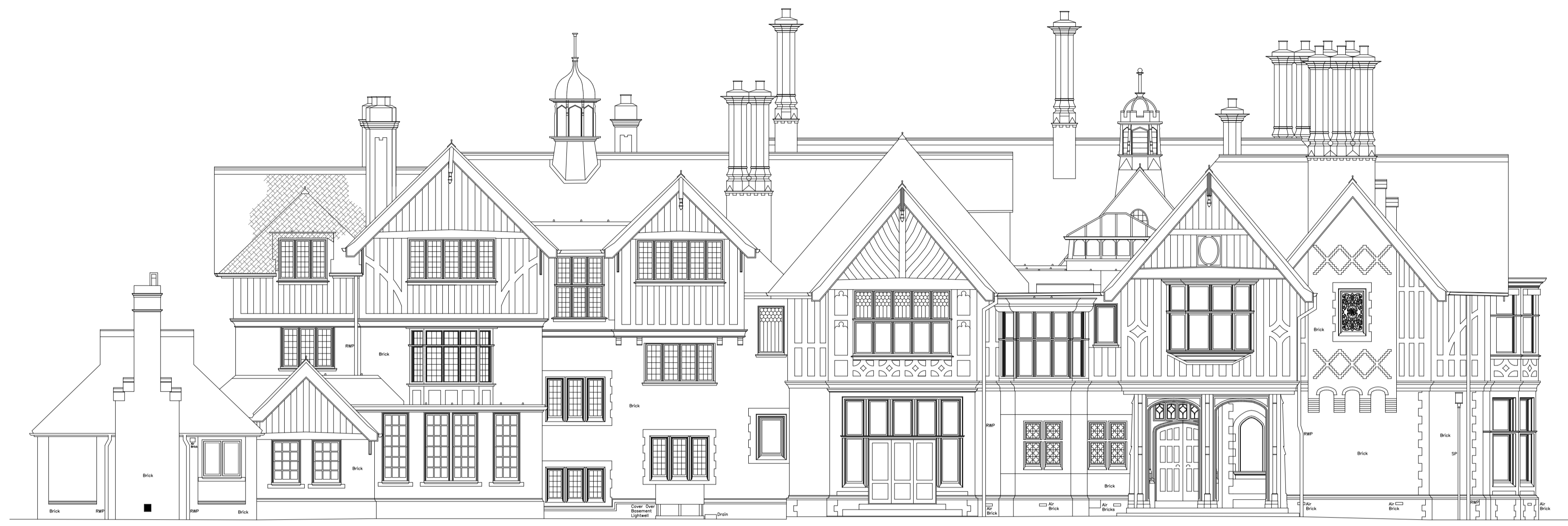
18m A.O.D. EXISTING WEST ELEVATION scale 1:100

KEMP HOUSE, 160 CITY ROAD, LONDON, EC1V 2HX, UK T: +44 (0) 7525 336644 Anna T: +44 (0) 7707 929182 Katarzyna E: info@shapeofarchitecture.com