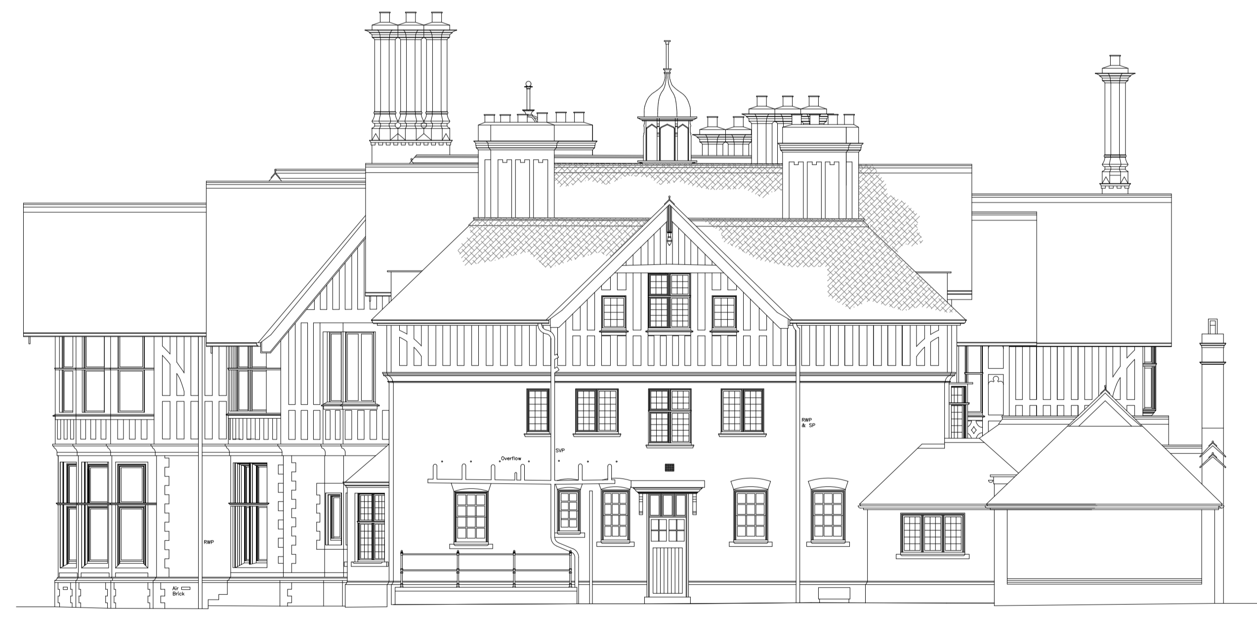
18m A.O.D. EXISTING NORTH ELEVATION scale 1:100