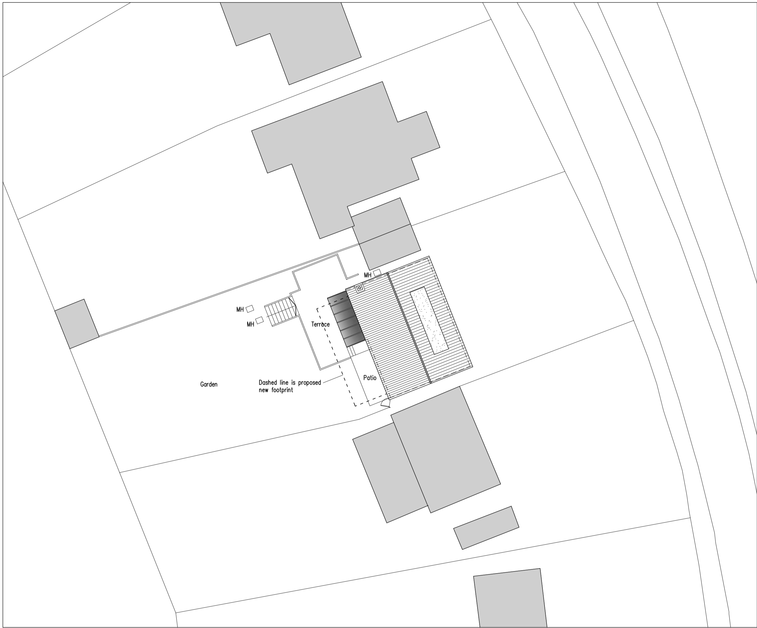
Existing Site Plan - with proposed shown dashed Scale: 1:200