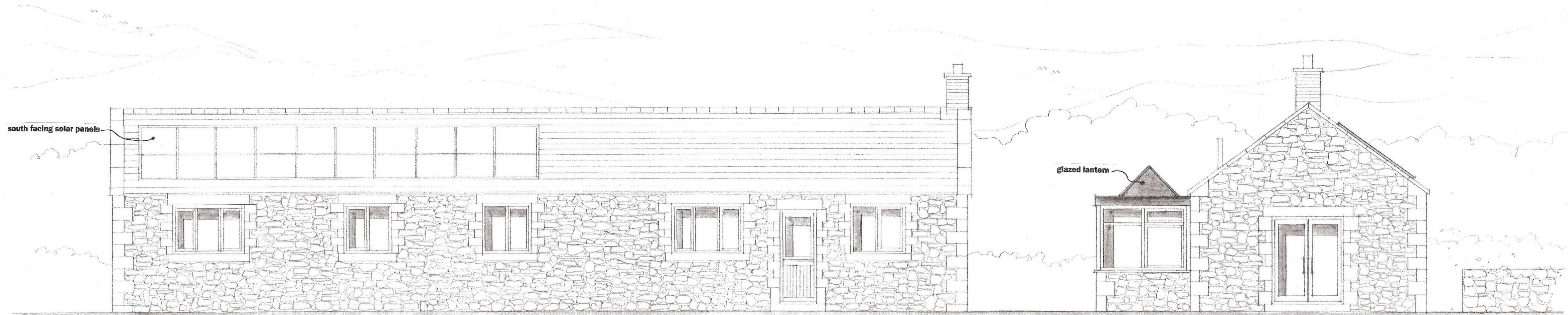
SOUTH FACING ELEVATION