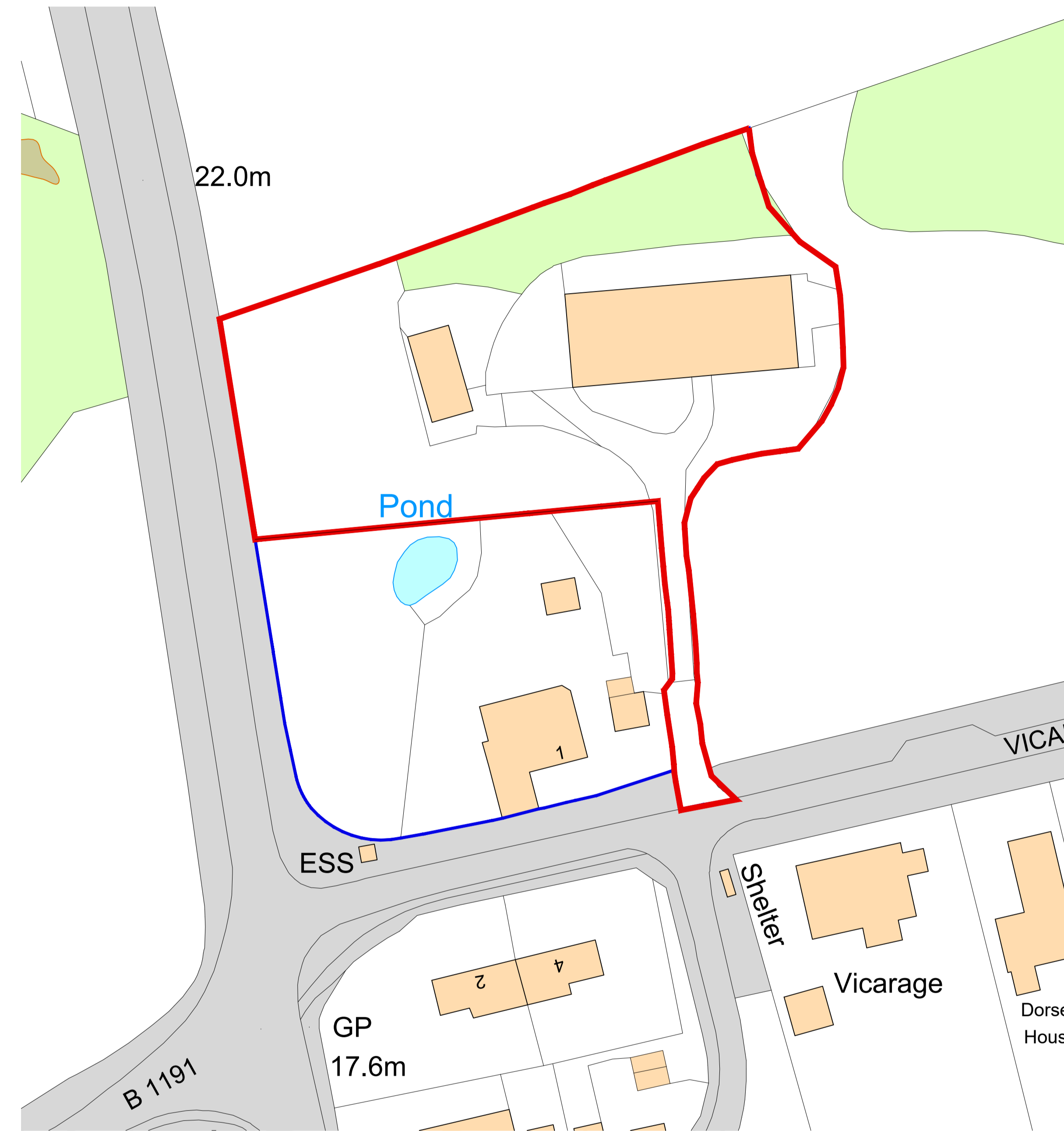
EXISTING BLOCK PLAN 1:500