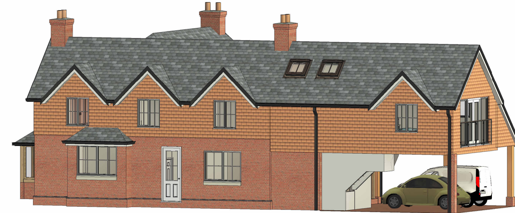
5 3D Front