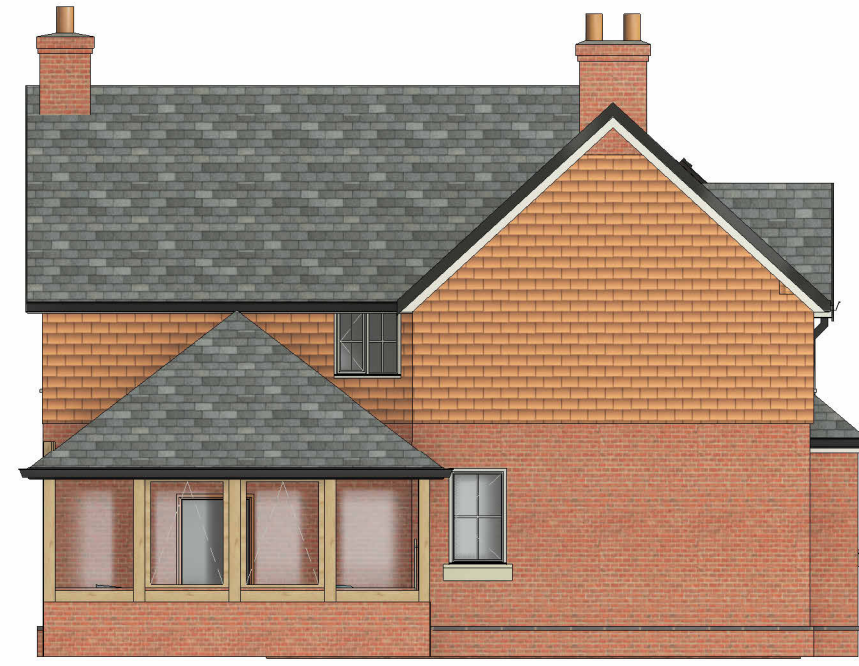
4 South West Elevation 1 : 100