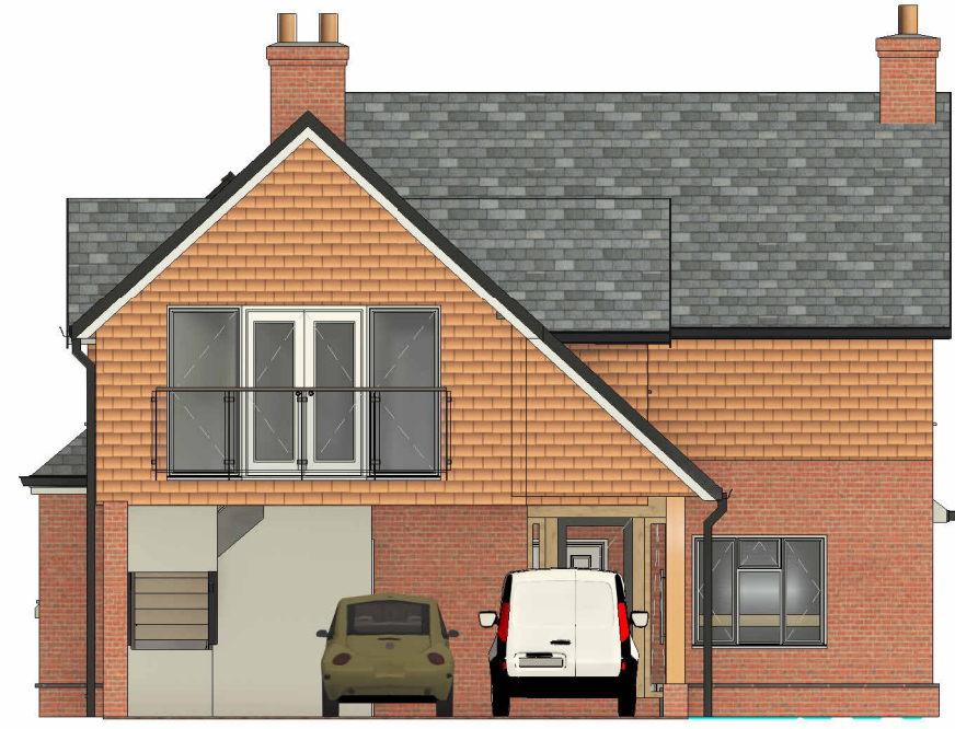
1 North East Elevation 1 : 100