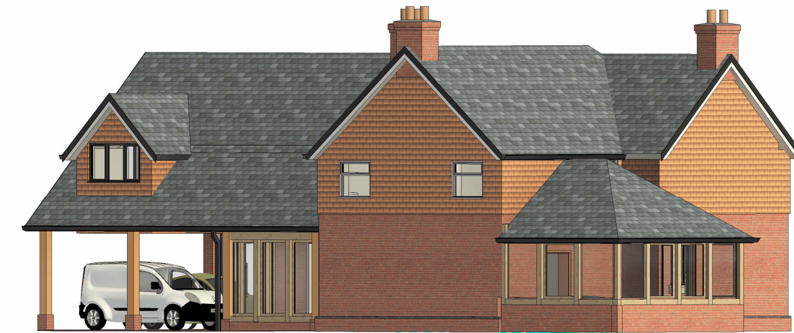
6 3D Rear