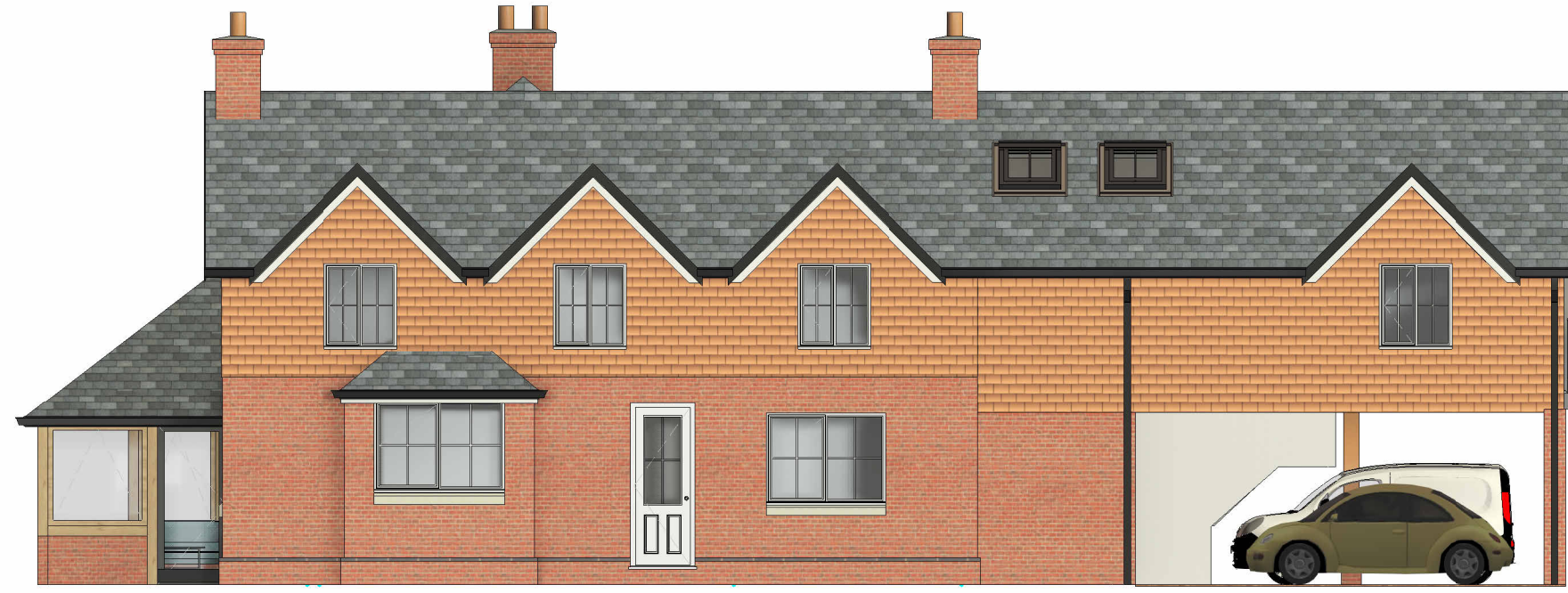
3 South East Elevation 1 : 100