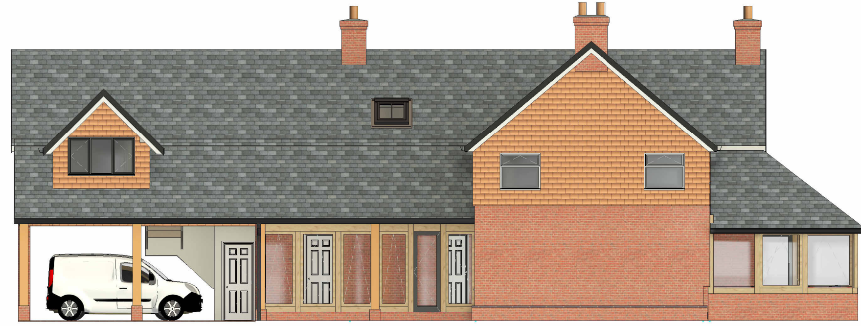
2 North West Elevation 1 : 100