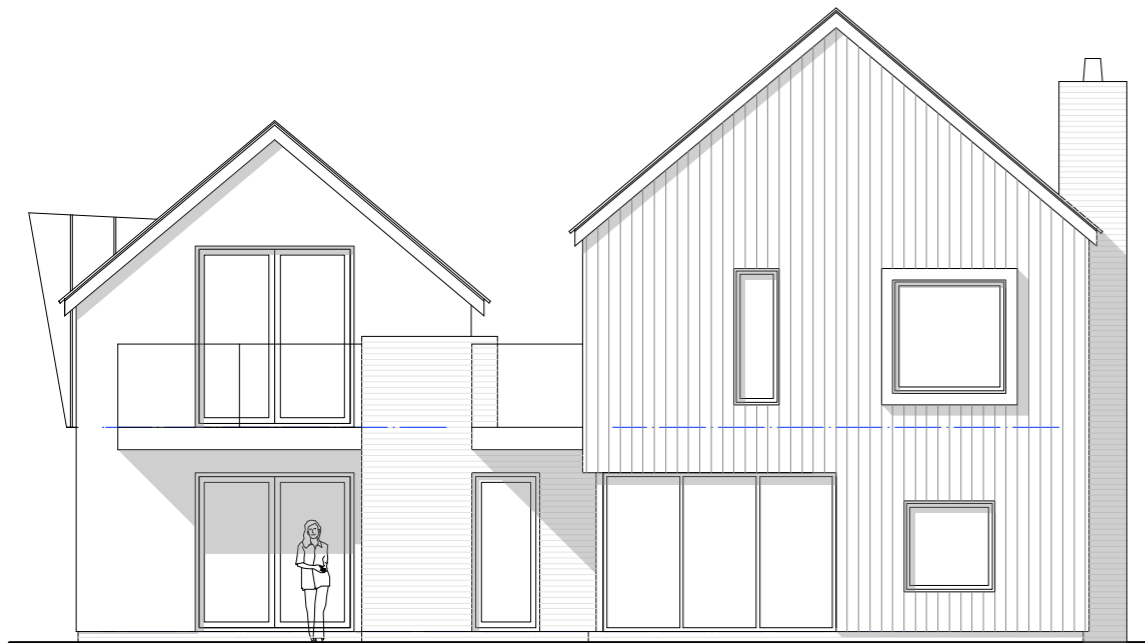
NORTHEAST ELEVATION 1:100