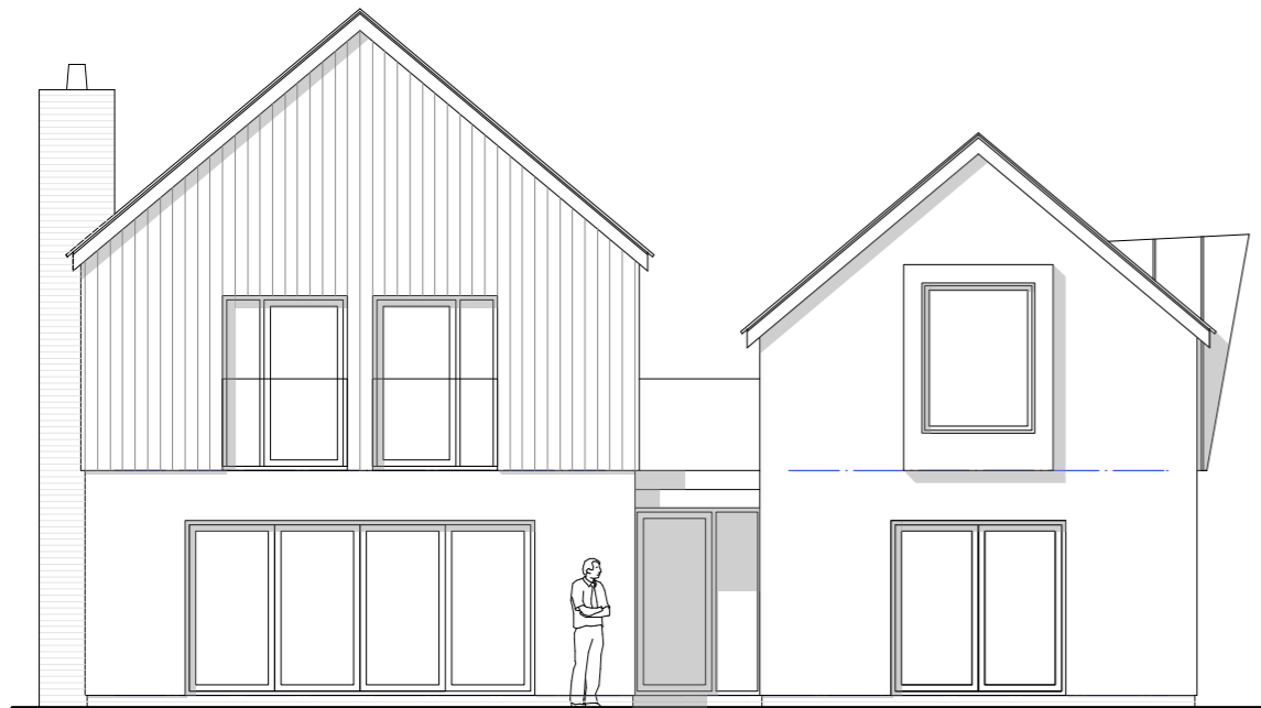
SOUTHWEST ELEVATION 1:100