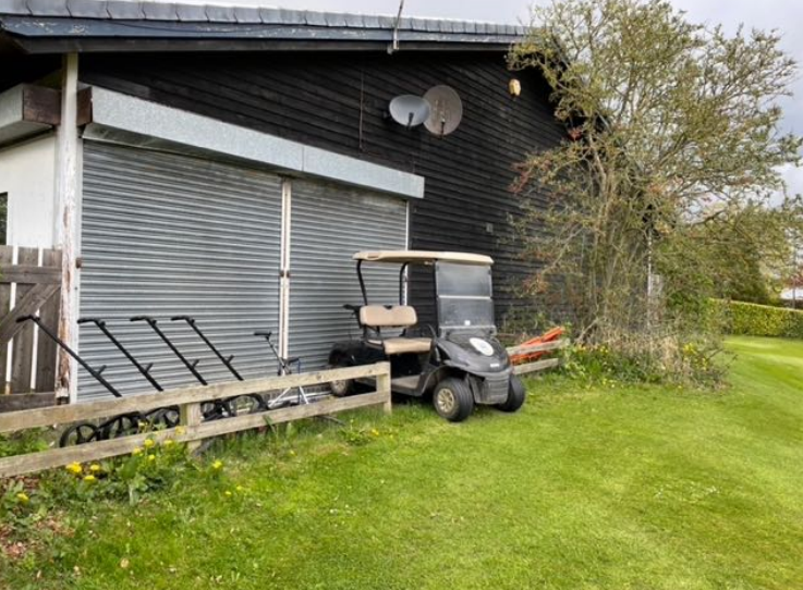
2 Existing Photo