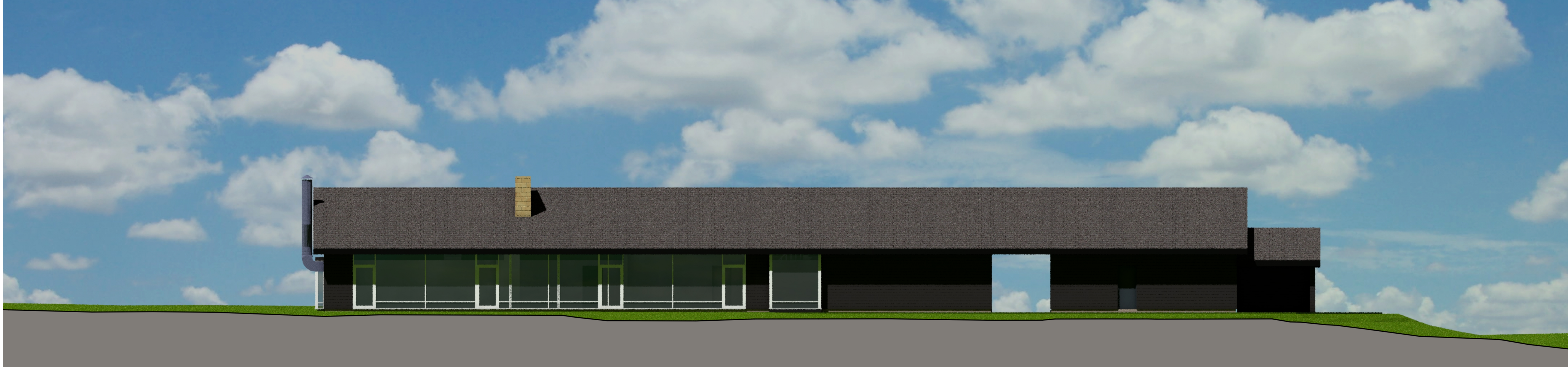
2 | Proposed Elevation - Facing Towards Course - Southwest A201 | Scale: 1:100

A1 Print at page size indicated, 100% scale. Always check scale bar. Day at stated scale at indicated sheet size. The use of this document and the information therein, is an acceptance of the following statements: This document is copyright and must not be reproduced, completely or in part, without the consent of Design Two. This document may be based upon information supplied by third parties and as such their accuracy cannot be guaranteed. This document drawing may be based upon the requirement to be read in conjunction with other documentation and that may not be relied upon solely. All work must be carried out in accordance with current and relevant statutory and regulatory standards including Construction Design & Management Regulations. As outlined in section 2.3 of the CDM Industry Guidance to Designers, insignificant risks can usually be ignored, as can risks arising from routine construction activities, unless the design compounds or significantly alters these risks. Do not scale this drawing. Not to be reproduced. E & E.O. © Design Two No. Date Issue Notes