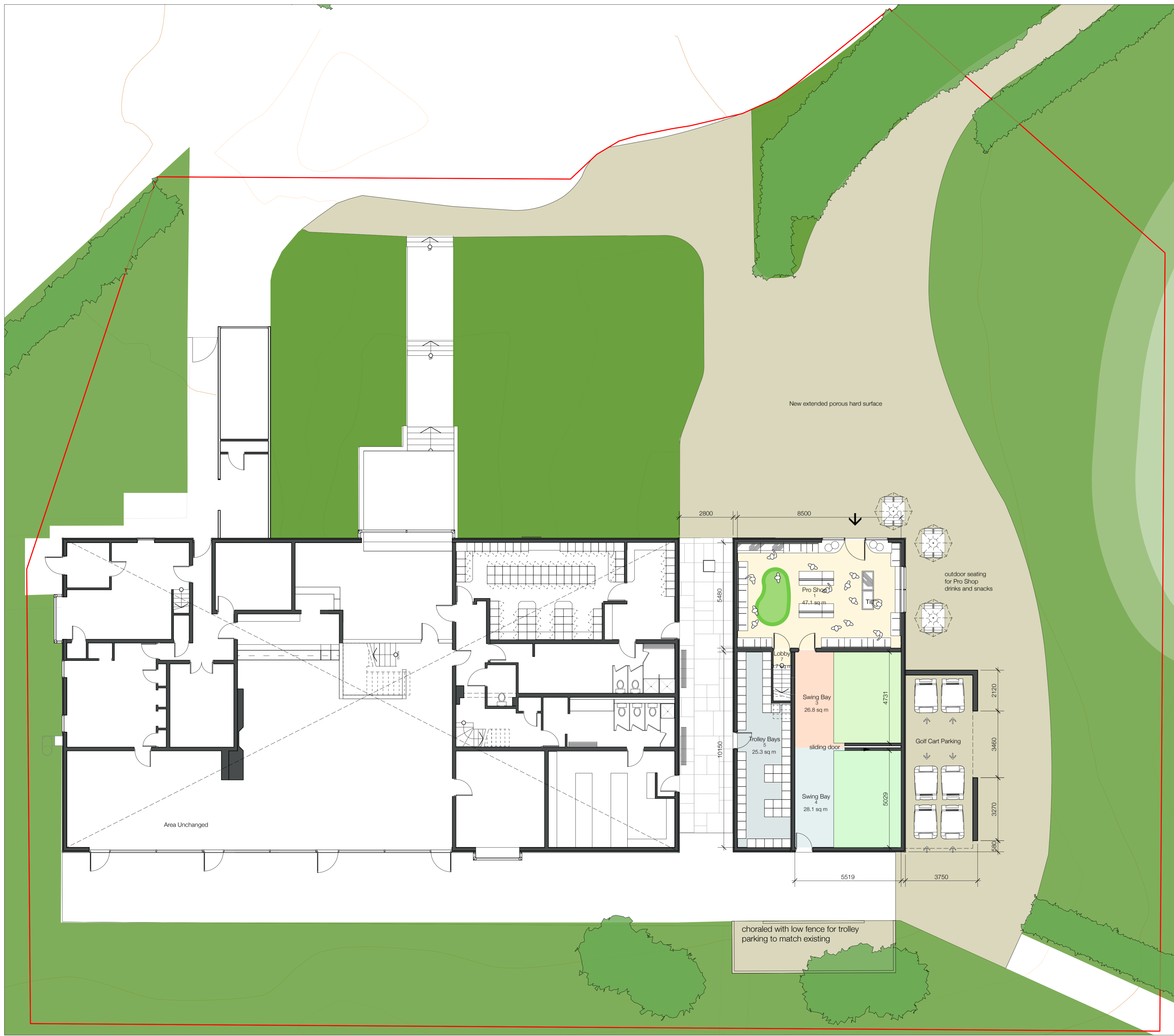
1 | Proposed Floor Plan and Site Plan - Ground Floor Level 1 A101 | Scale: 1:100