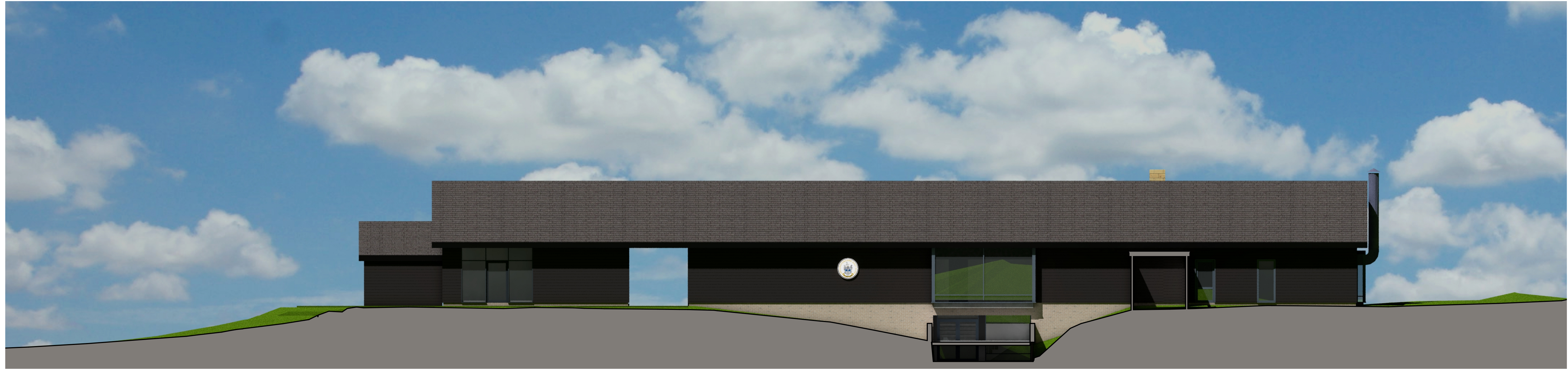
1 | Proposed Elevation Facing Car Park - Northeast A202 | Scale: 1:100

A1 Print at page size indicated. 100% scale. Always check scale bar. Day at stated scale at indicated sheet size. The use of this document and the information therein, is an acceptance of the following statements: This document is copyright and must not be reproduced, completely or in part, without the consent of Design Two. This document may be based upon information supplied by third parties and as such their accuracy cannot be guaranteed. This document drawing may be based upon the requirement to be read in conjunction with other documentation and that may not be relied upon solely. Any discrepancies in document should be reported in writing to Design Two. All work must be carried out in accordance with current and relevant statutory and regulatory standards including Construction Design & Management Regulations. As outlined in section 2.3 of the CDM Industry Guidance to Designers, insignificant risks can usually be ignored, as can risks arising from routine construction activities, unless the design compounds or significantly alters these risks. Do not scale this drawing. Not to be reproduced. E & E O. © Design Two No. Date Issue Notes