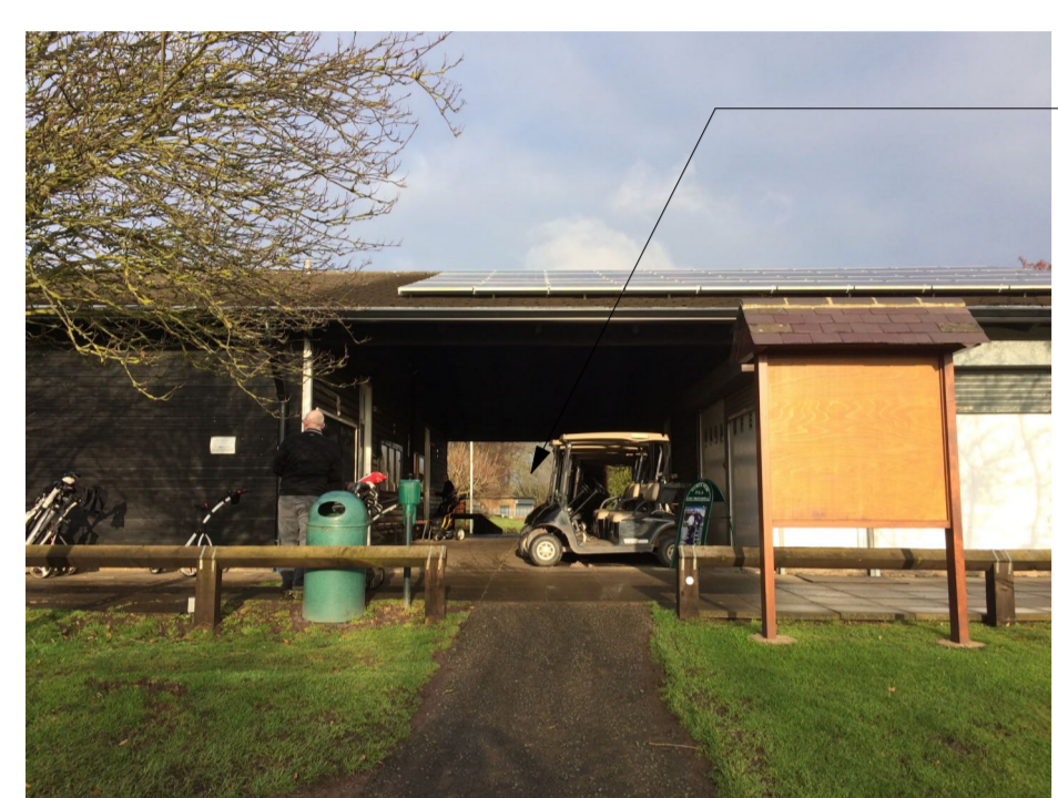
4 Existing View of Gap Through Club House A007