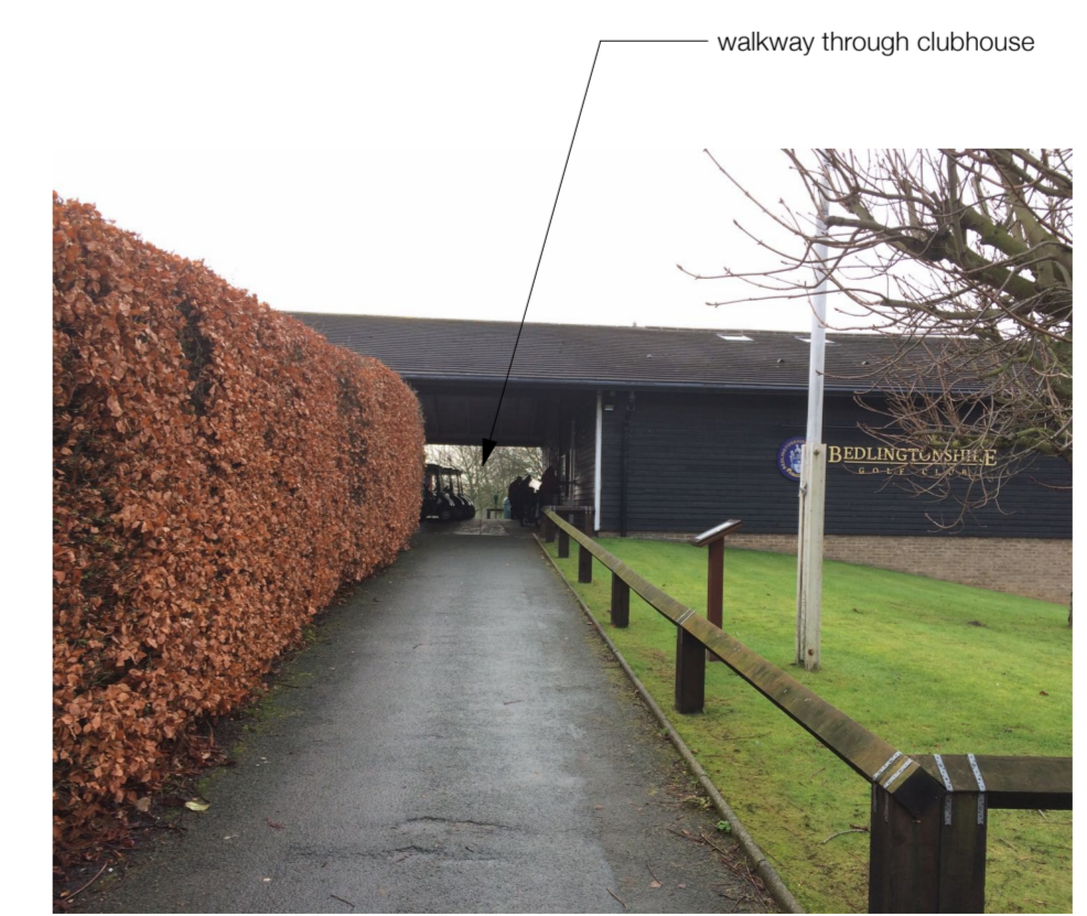
6 Existing View to 'Tunnel' A007