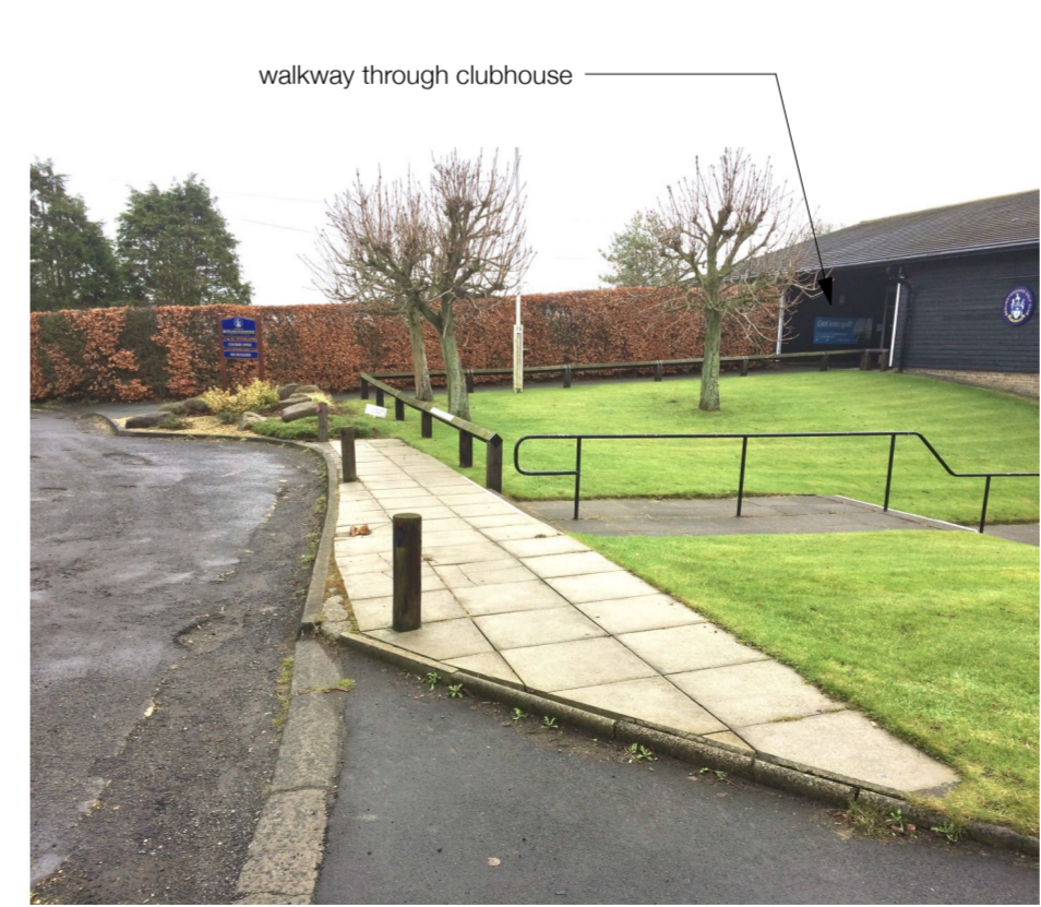
5 Existing View from Main Road A007