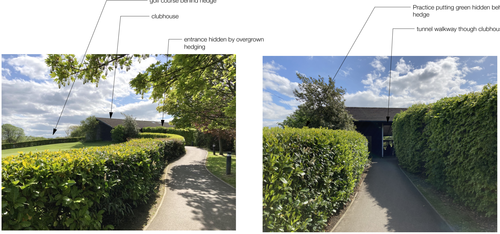
2 Existing Main Approach from Car park A007