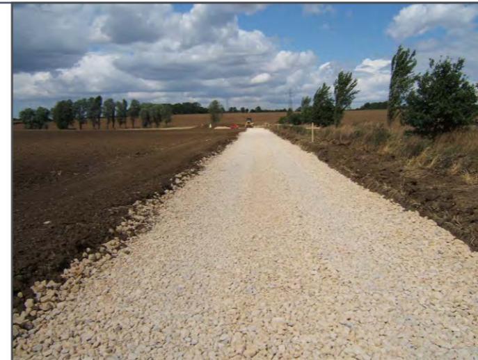
Inset - Typical Access Track Appearance