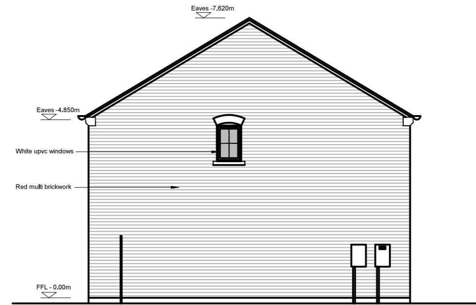
02 Existing Side Elevation 1:100 @ A3