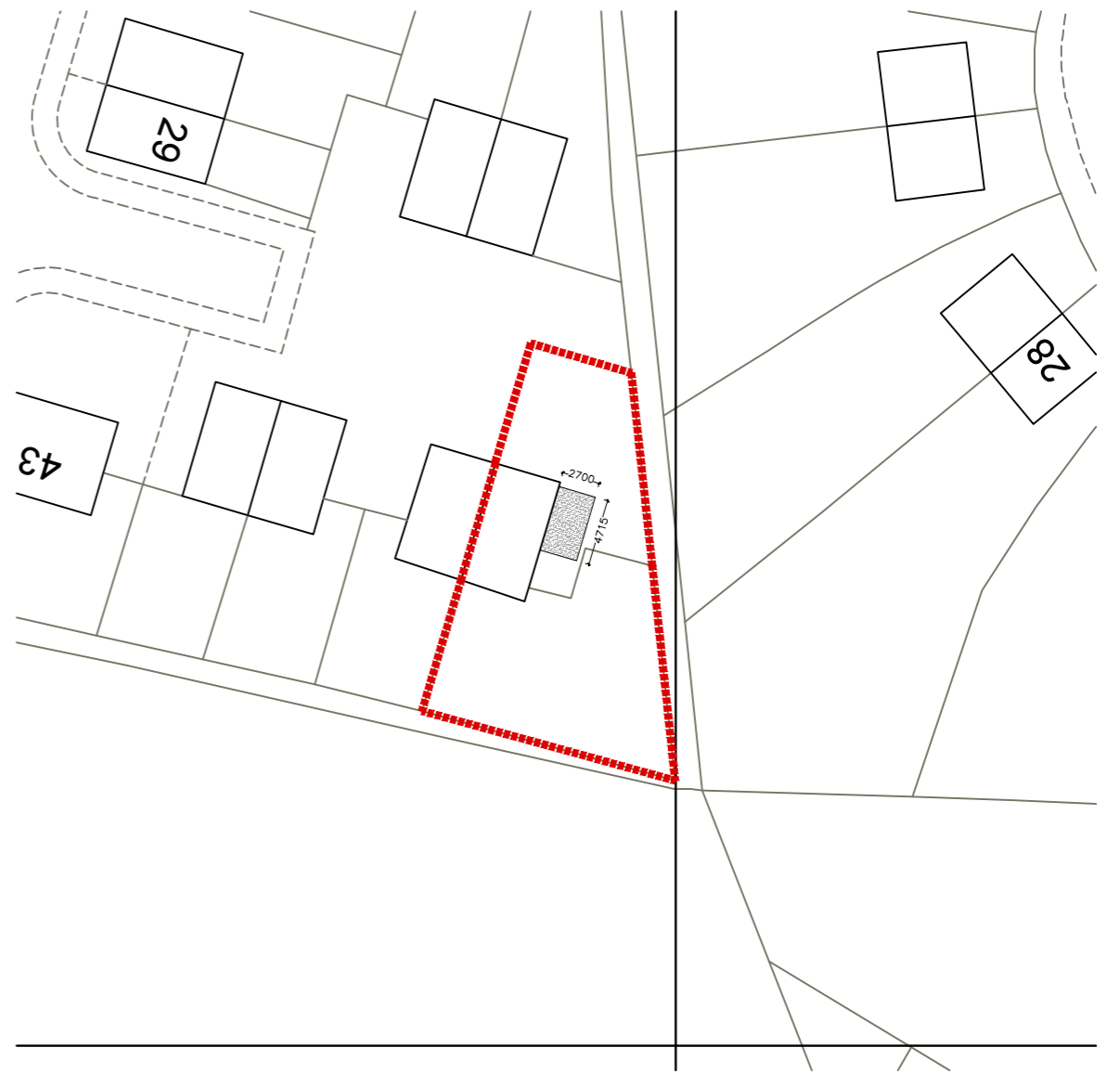
02 | Site Block Plan 1:500 @ A3