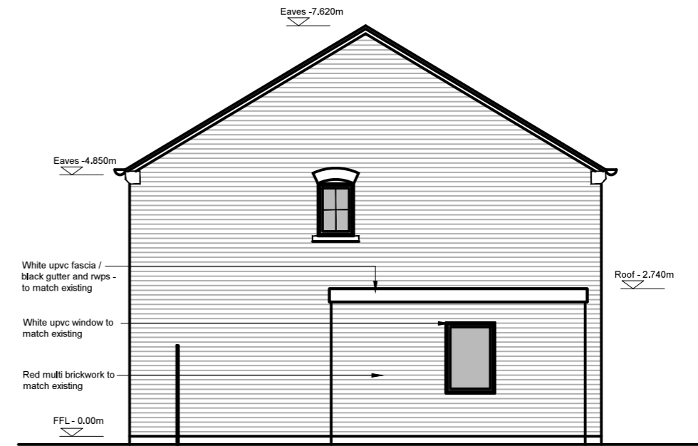
02 Proposed Side Elevation 1:100 @ A3