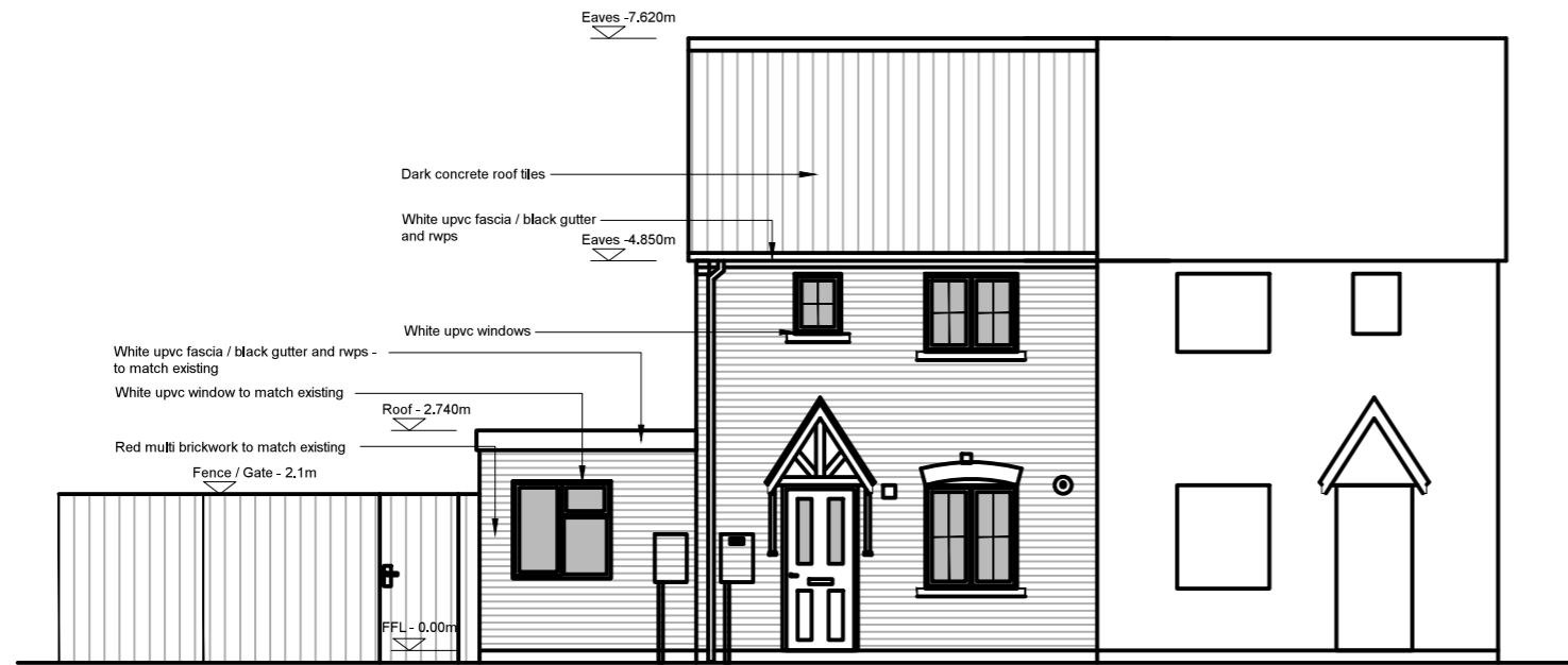
01 Proposed Front Elevation 1:100 @ A3