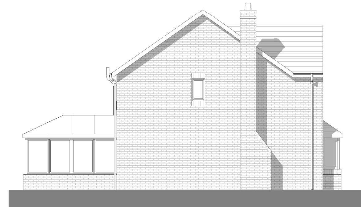
Side Elevation (from 52 Satinwood Crescent) 1 : 100