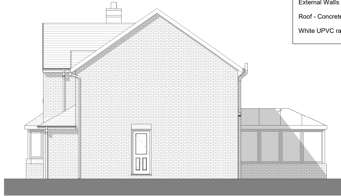
Side Elevation (from 48 Satinwood Crescent) 1 : 100