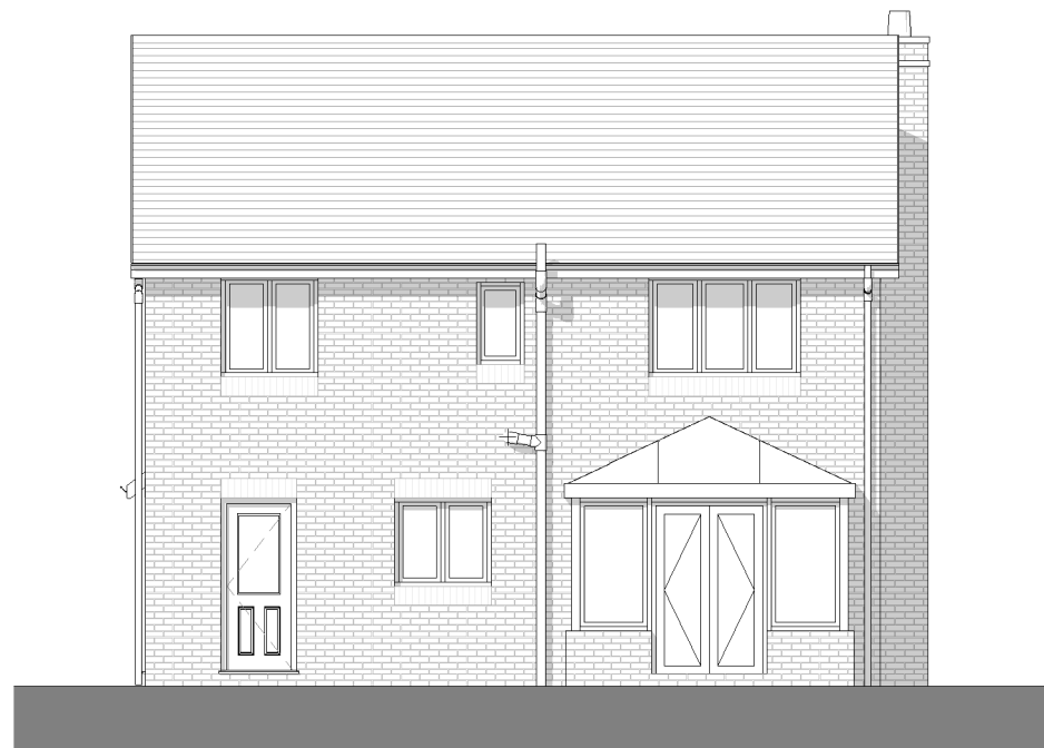
Rear Elevation 1 : 100