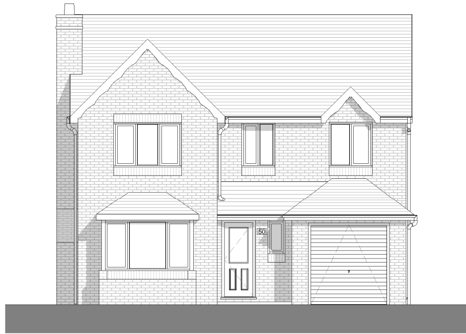
Front Elevation 1 : 100

The Contractor is to check all dimensions and conditions on site before commencing. Do not scale from this drawing. This drawing remains the copyright of Reid Design Limited