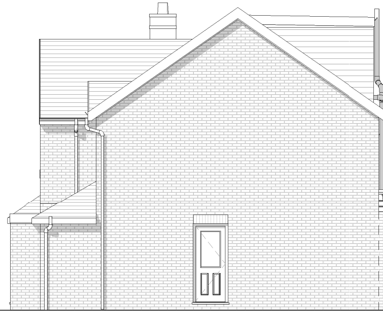
Side Elevation (from 48 Satinwood Crescent) 1 : 100