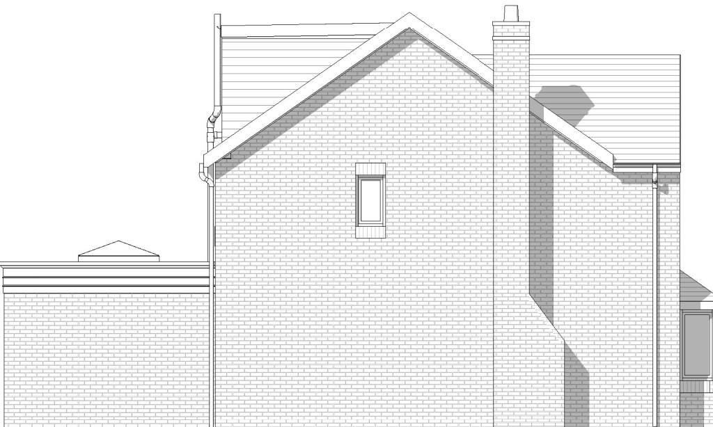
Side Elevation (from 52 Satinwood Crescent) 1 : 100