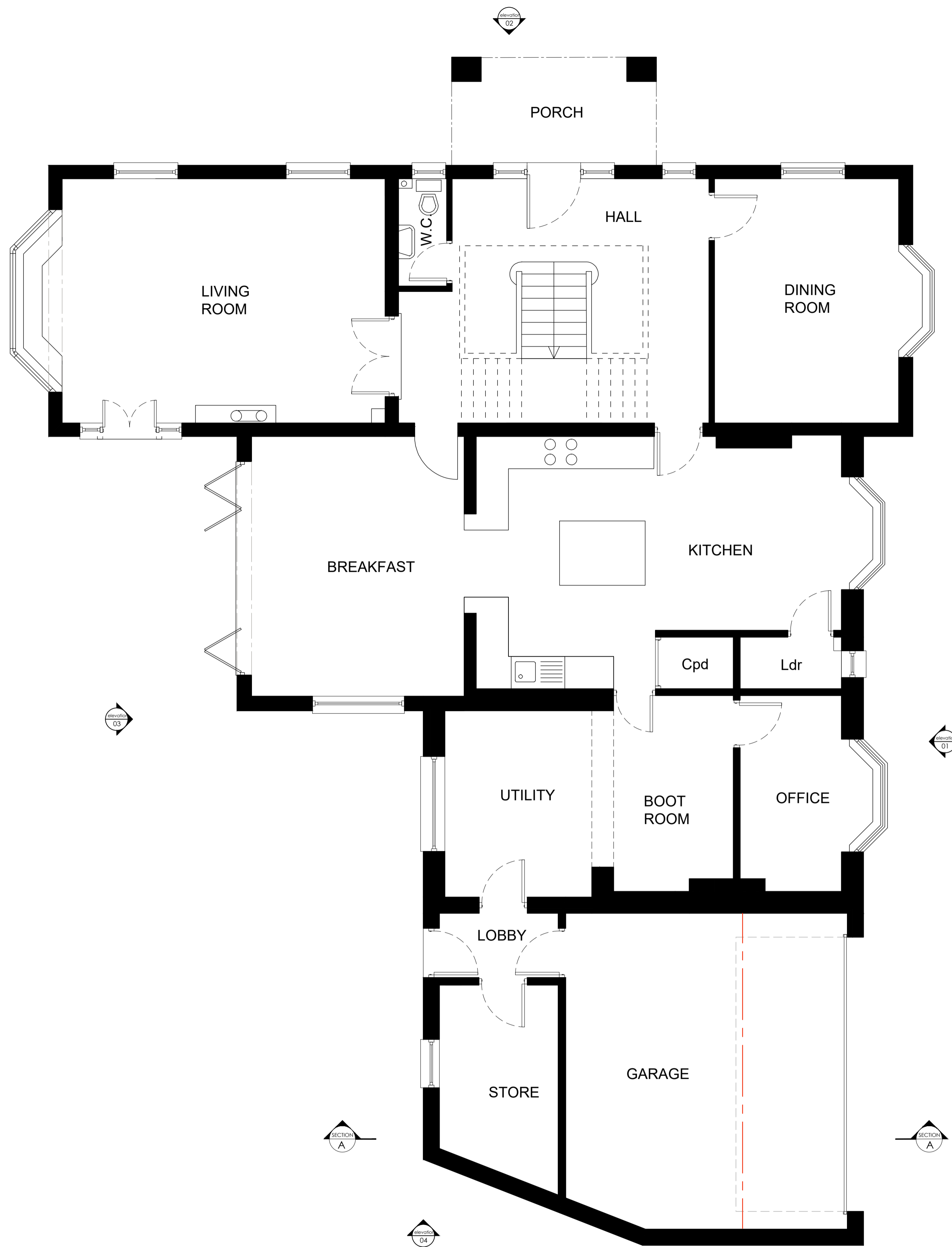
GROUND FLOOR PLAN PROPOSED 1:50 @ A1