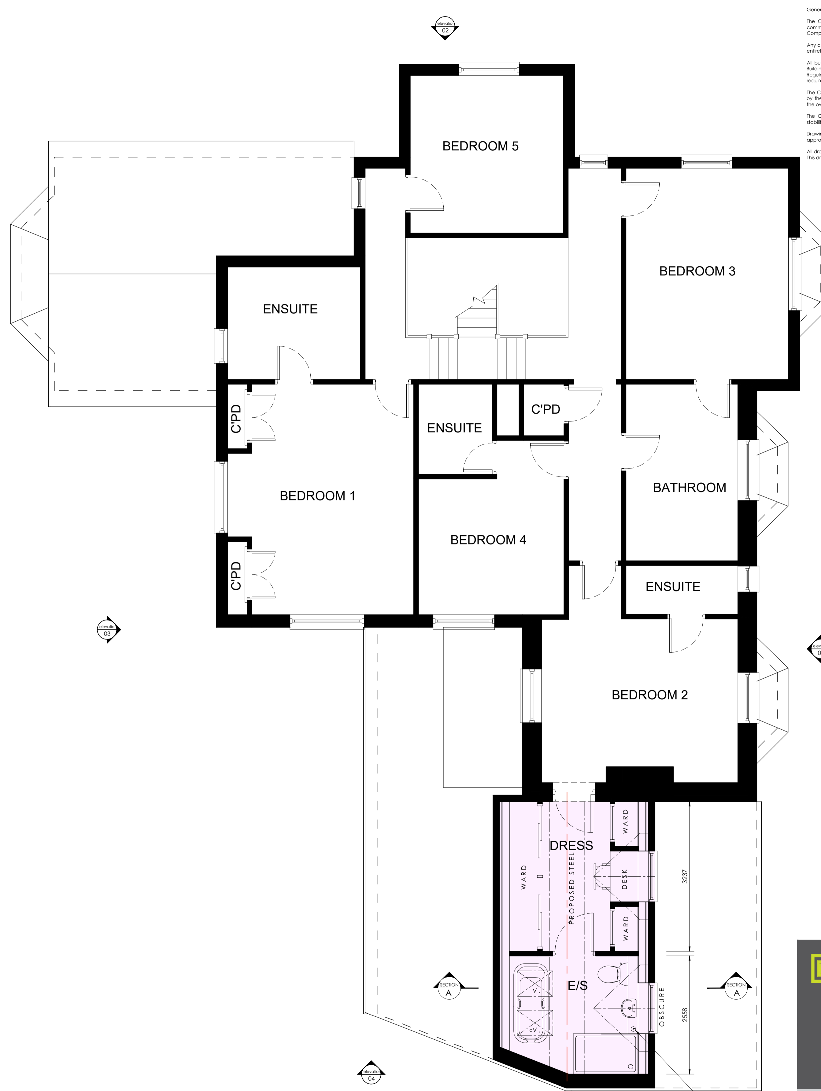
FIRST FLOOR PLAN PROPOSED 1:50 @ A1

General Notes: The Contractor is responsible for checking all dimensions on site prior to commencement of the works with any error being reported to Ely Planning Company (Cambridge) Ltd as soon as possible. Any construction work carried out prior to receiving all necessary approvals is entirely at the householder's / client's risk. All building work to be carried out to the satisfaction of the Local Authority Building Control Officer and in accordance with the current Building Regulations and as such additional unforeseen building works may be required on site. The Contractor shall inspect all adjoining properties which may be affected by the works prior to commencement of works and record and report with the owner any defects. The Contractor shall be entirely responsible for the security, strength and stability of the building during the course of the works. Drawings produced for the purpose of obtaining Building Regulations approvals only and do not constitute full working drawings. All drawings are the copyright of Ely Planning Company (Cambridge) Ltd. This drawing may not be copied by any third parties without prior permission.