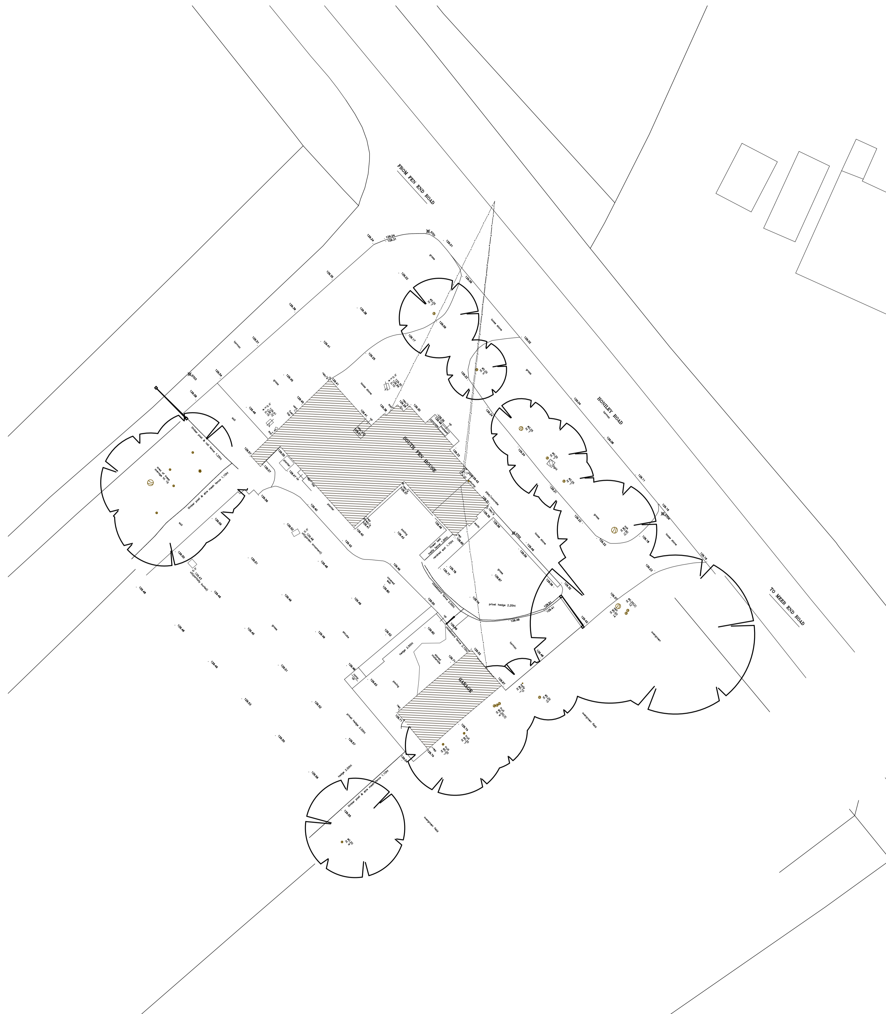
EXISTING SITE PLAN SCALE 1:200 @A1