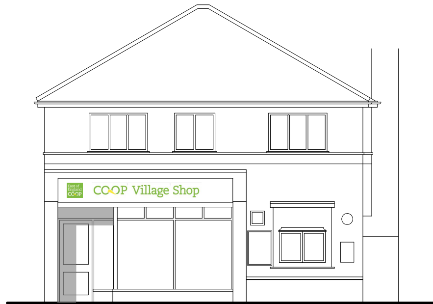
north east elevation existing