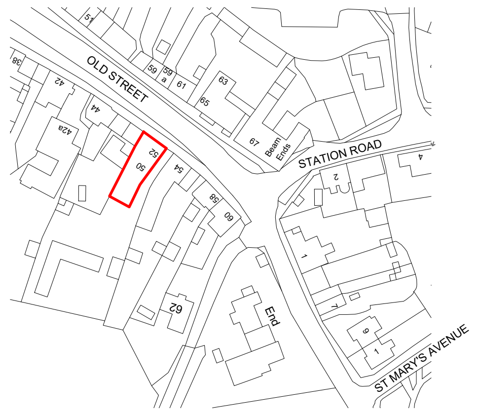
location plan 1:1250