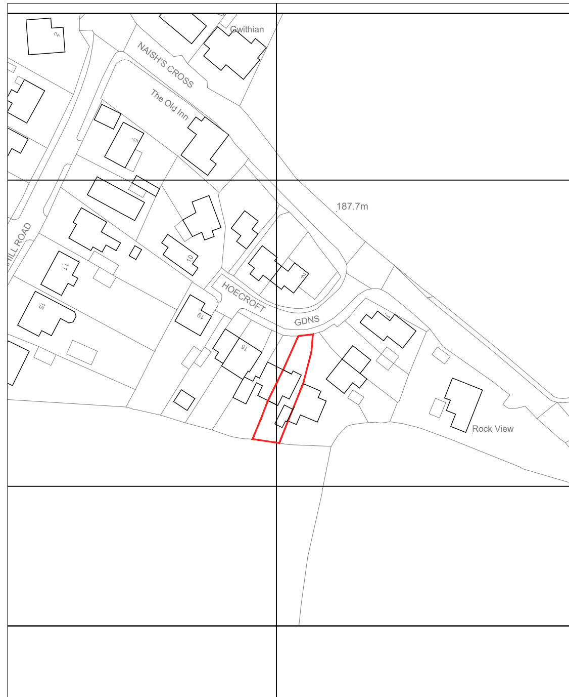
EXISTING LOCATION PLAN SCALE 1:1250 All dimensions to be checked on site