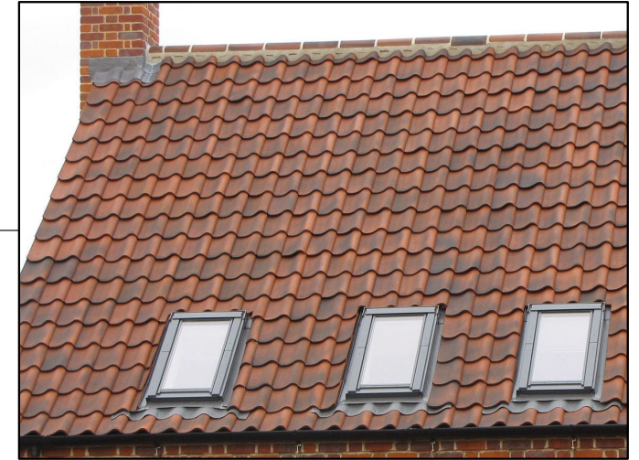
Lifestiles Ashvale Restoration Clay Pantiles to Houses