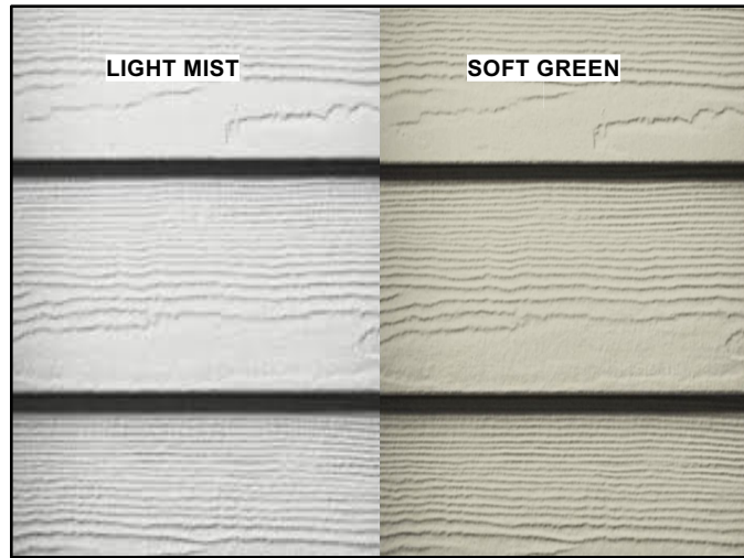
Hardie Plank Composite Weather Boards Example shades - final colour to be agreed.